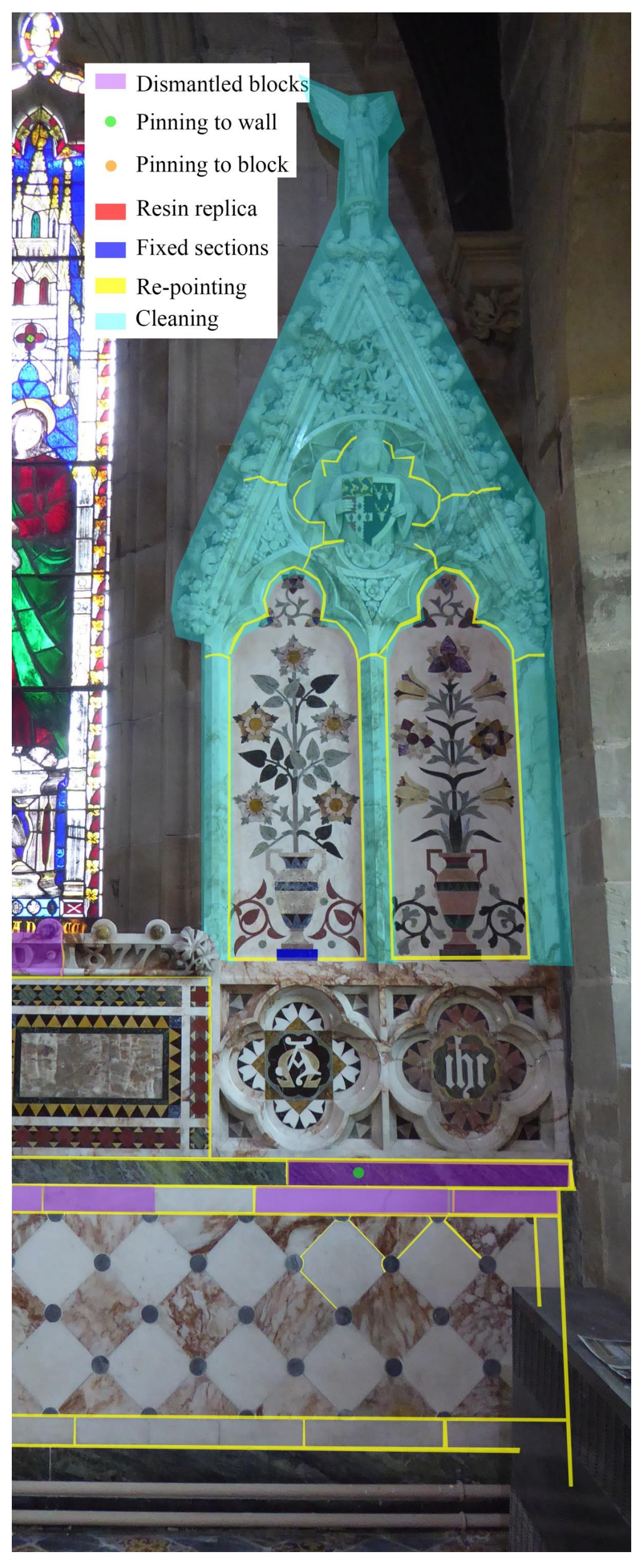
Conservation works mapping to the right area of the reredos