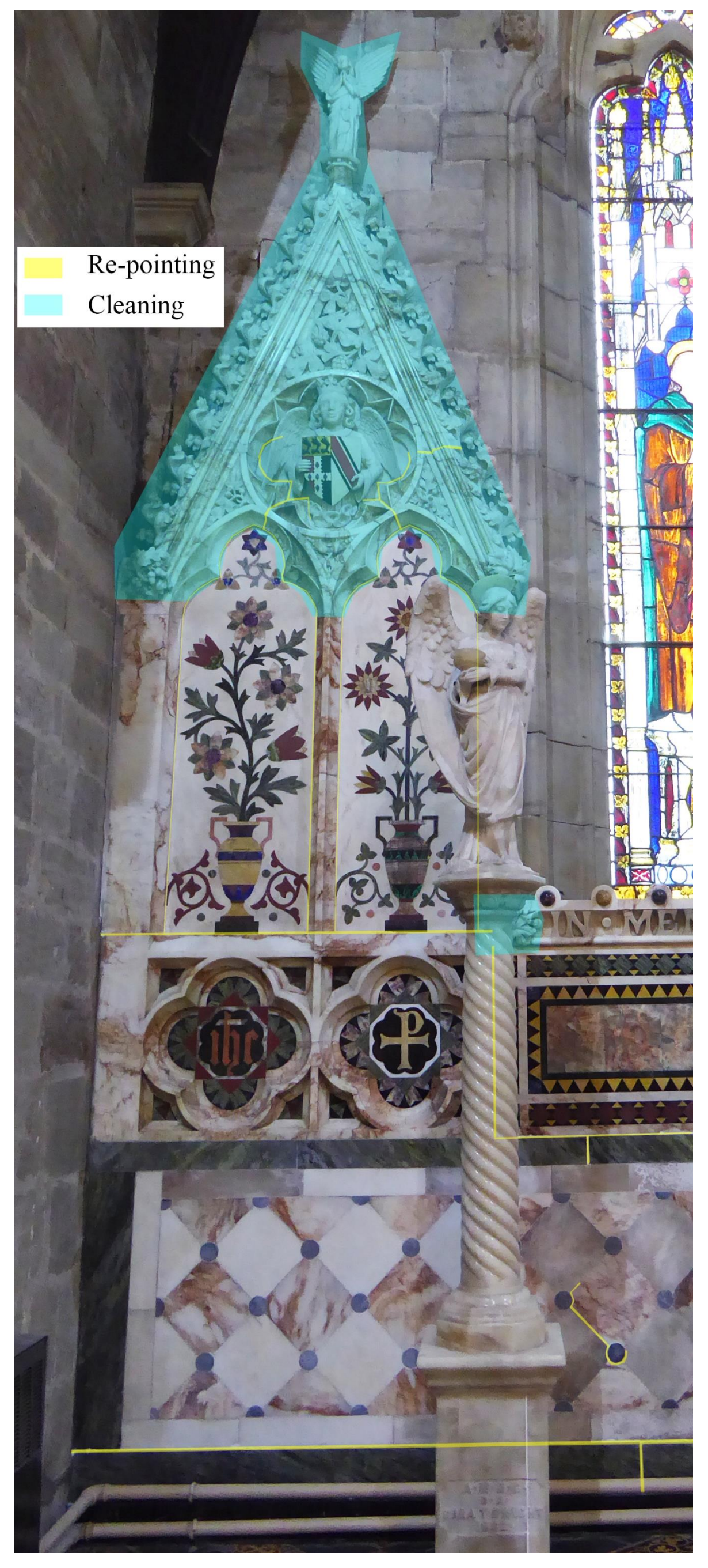
Conservation works mapping to the left area of the reredos