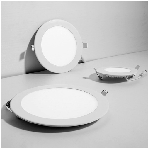
LED recessed downlight 12W ultra-thin (10mm installation) warm white (3000k) 300mmØ