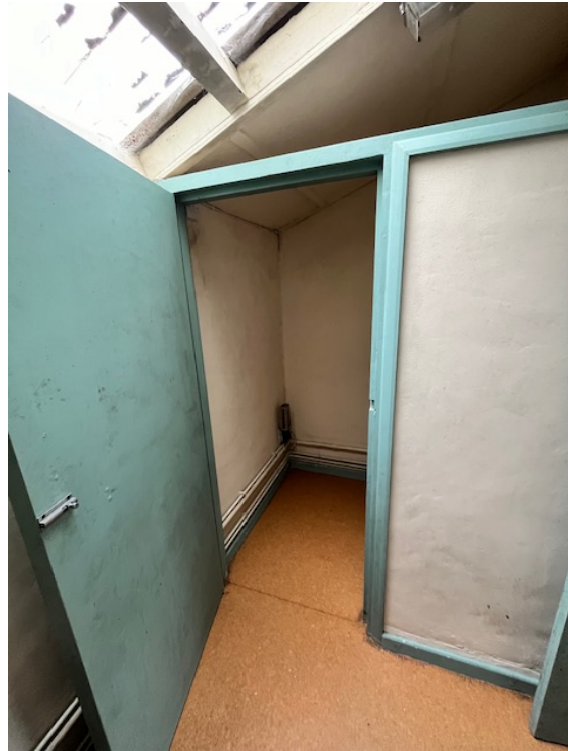
Existing roof from the inside and existing toilet facilities.