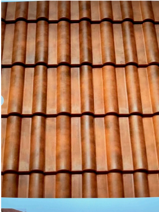
Proposed roof lights and tiles.