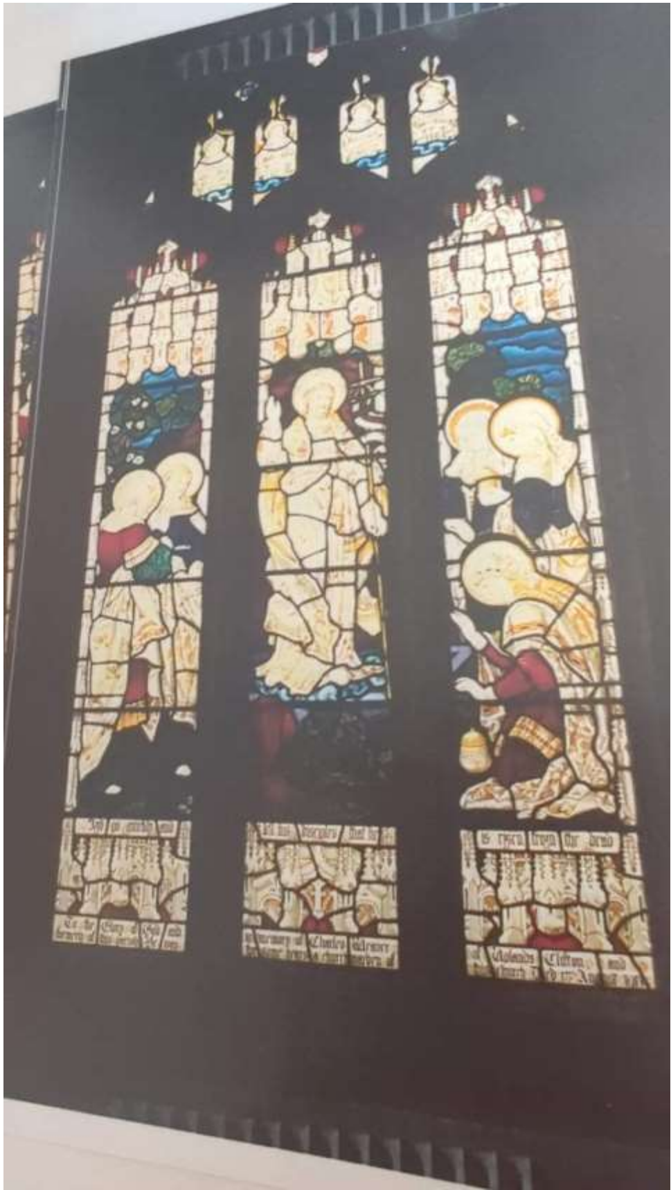
Image shown is pre-vandalism which occurred to the lower right-hand panel.