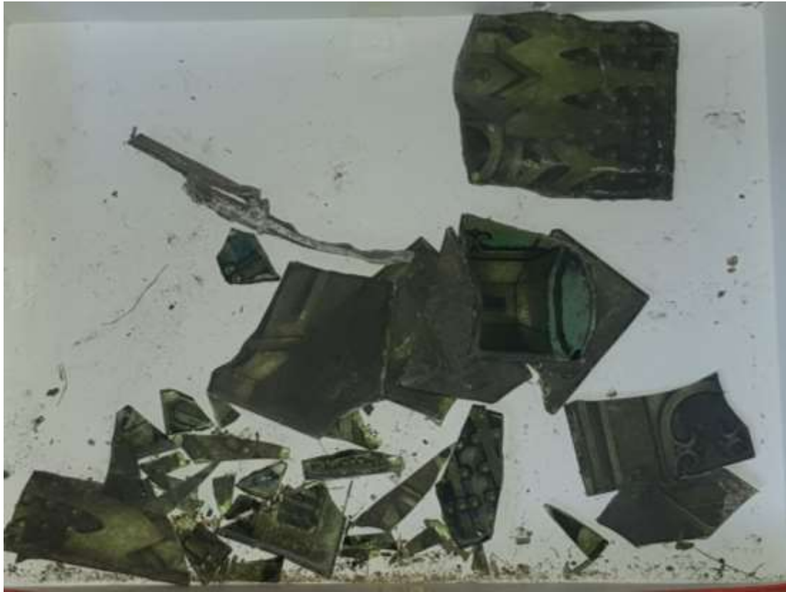
Other Sections of Broken Glass retrieved from surrounding Area

The Second Window is on the South elevation, seen from the South Aisle: