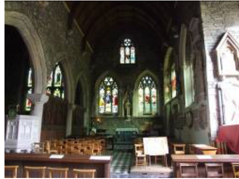
The Lady Chapel looking east

The south aisle has the arms of Bishop Lacy on one of the carved corbels.. Fragments of the rood screen with key, sword and shield are fastened to the south door to the Lady Chapel.