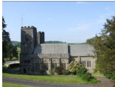
The church seen from the south

river flood plain begins. There is a row of attractive stone houses on the other side of the road. There is still a pub a short distance to the west, the Eliot Arms, and adjacent to it a community run small post office and shop. There is an attractive quayside with private sailing club.