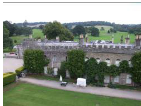
Port Eliot seen from the church roof, looking north across the park towards the estuary

It still incorporates parts of the Medieval Priory, including the probable line of the undercroft of the north range opposite the church, with the cloister garden between, now a lawn. This lawn also has a service tunnel with gratings, running east-west near the house. This must have done considerable damage to archaeological remains when it was dug, if any remained following the exhumation of the graves in the area in the early 19 th century.