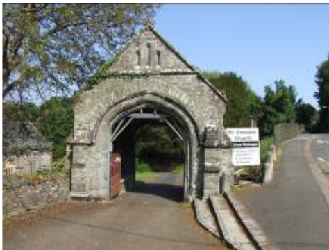
The lych-gate seen from the west, the temporary struts now removed following repair work

The cast iron railings are set into a low stone wall run east from the lych-gate along Church Street, with fluted stanchions and urn finials, and middle and top rails with trefoil finials – also Grade II listed. There are gratings at the top of the bank within this fence, beneath which is a service tunnel which ran east-west here and comes out under the lych-gate as a tunnel-vaulted passage.