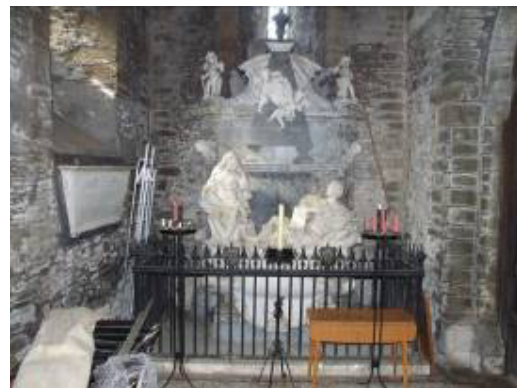
The Rysbrack monument in the north tower space – not its original location

Monuments: A fine collection, only the most important are listed here. Pre-eminent is the Rysbrack monument in the north-west tower base (originally in the south aisle), to Edward Eliot, 1772, of national artistic significance. This is one of Rysbrack's earliest commissions in England. The Earl is shown in Roman dress, and has typically short legs.