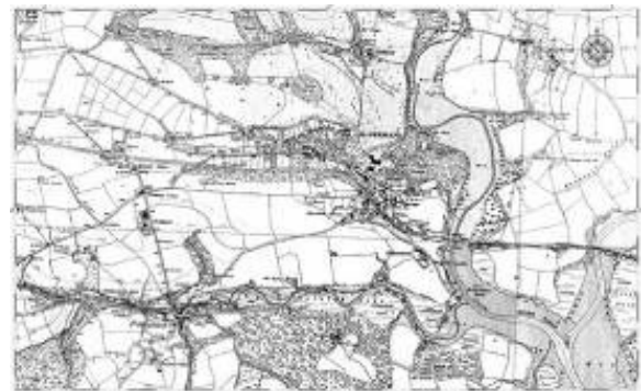
1888 map of St Germans

This is an Area of Outstanding Natural Beauty. The River Tiddy (a tributary of the Tamar) broadens into an estuary to the east of the village, a designated Site of Special Scientific Interest. The name Port Eliot is well chosen, as the river originally (and probably up to the late 18 th century landscaping) came close to the present house, explaining the location of the church and priory. The contours of the land and differential growth patterns give clues to the original course, and could be the subject of an interesting study, which is beyond the parameters of this document.