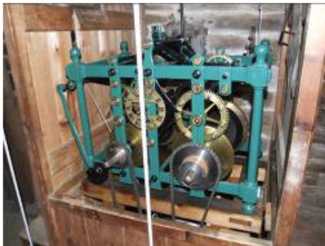
The clock mechanism

Clocks and dials: Fine clock mechanism in the south tower, repaired with CBC grant in 2004. Large 18 th -century sundial against the base of the north transept, missing its gnomon.