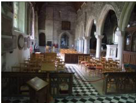
The south aisle looking west

A sign on the internal south porch door warns you that there are six steps inside, but nothing could prepare you for the bear-trap within, six narrow but deep stone steps plummeting down to the floor below. If there have been no injuries to date, then this is very fortunate.