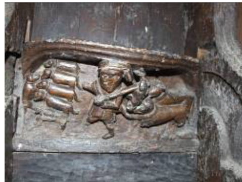
The misericord carving of a hunt

There is a single Medieval bench with Misericord in the south aisle, depicting (supposedly) a local character called Dando punished for hunting on a Sunday, otherwise chairs.