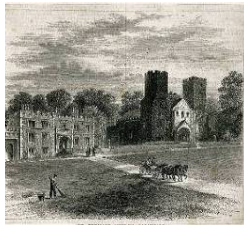
Print from the Skeat collection in the CBC file, c1850?

It is traditionally held that this collapse caused the south arcade to be rebuilt up to the west bay with granite piers in a neo-Norman style at this point, though this theory may need to be tested by more research.