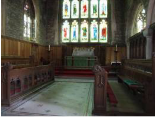
The chancel looking east

The chancel has an attractive mosaic floor (being restored at time of writing with funds from the Church Commissioners) and choir stalls with richly moulded ends, and panelling all around the east and north walls enclosing a stone frieze depicting the Last Supper as a reredos. Fine stained glass in the large window above provides a fitting setting for the High Altar.