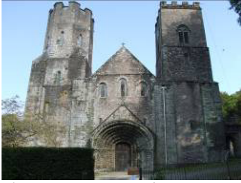
The great Norman west front

The twin towers provide considerable vertical emphasis when seen from the park, and the sheer size cannot fail to impress the visitor. One does immediately wonder if the west door within the impressive and completely unrestored Norman doorway could not be used as the main access, as originally intended. Access here is level, by contrast with the south porch entrance (see below). The reason may be draughts, birds and insects, but there may be solutions to this.