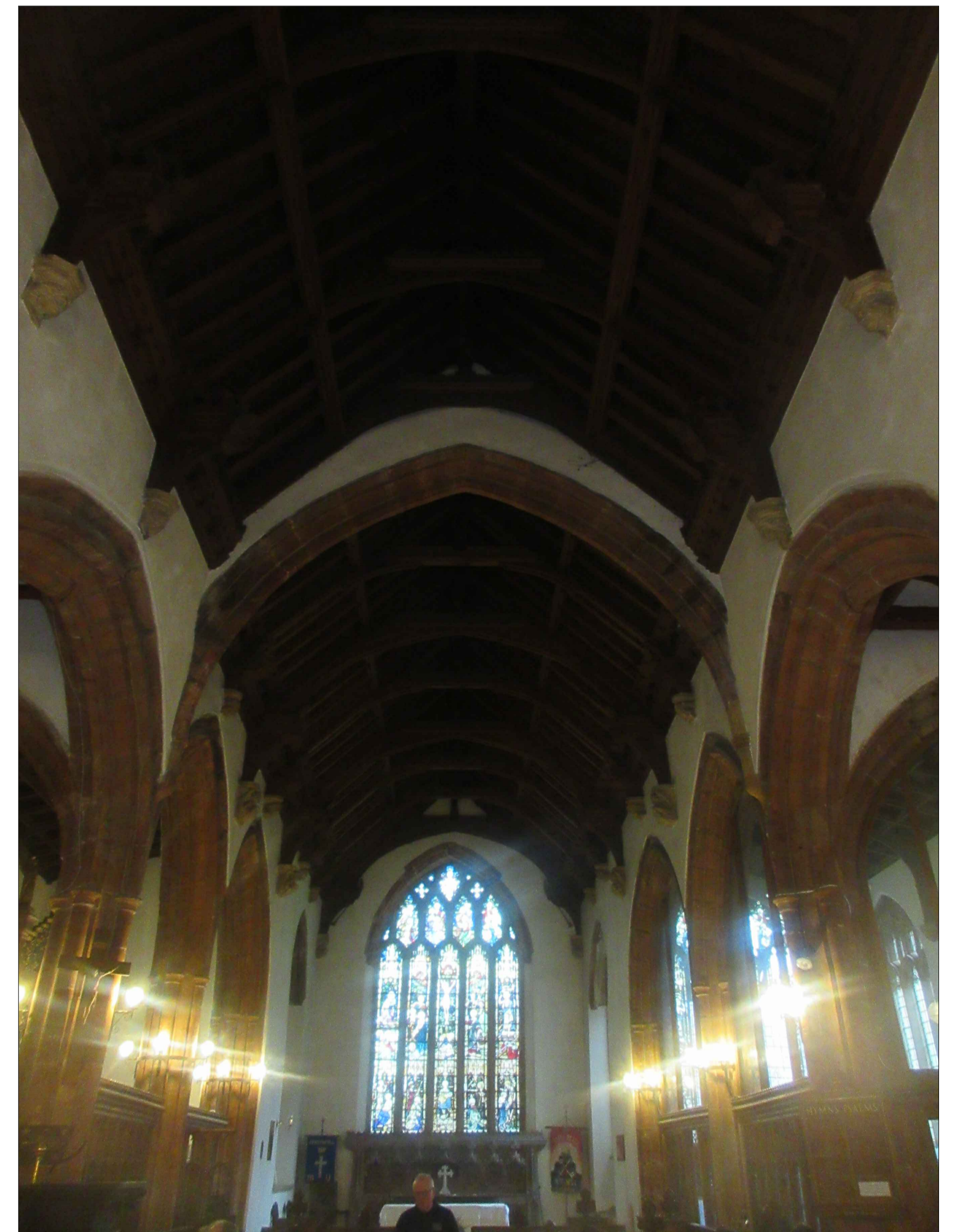
PHOTO OF THE WEST FACE OF THE CHANCEL ARCH