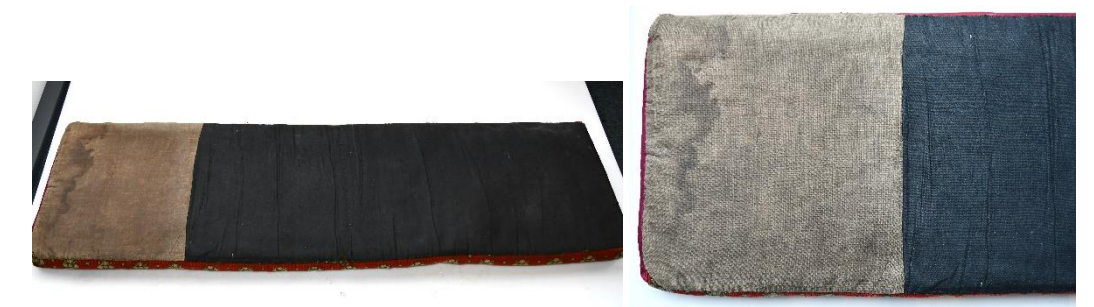
Back overall and detail of long altar kneeler 1 before dismantling

The removed back and side panels and horsehair pads were packed for return to the client.