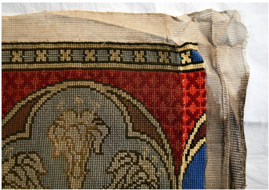
Detail of the clean and unfaded section of embroidery