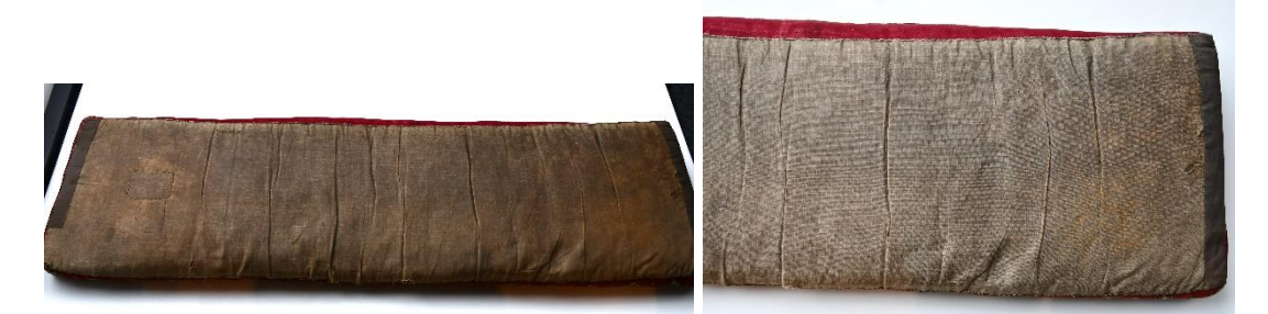
Back overall and detail of long altar kneeler 2 before dismantling