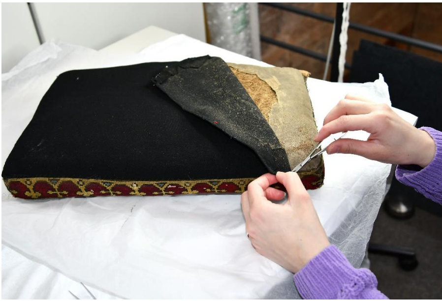
Releasing the back panel of pew kneeler 1