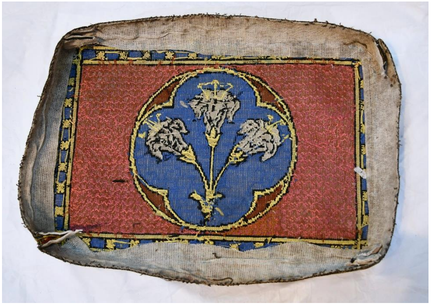
Reverse of canvaswork top over of pew kneeler 2