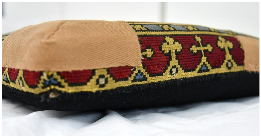
Side view of pew kneeler 1 before dismantling