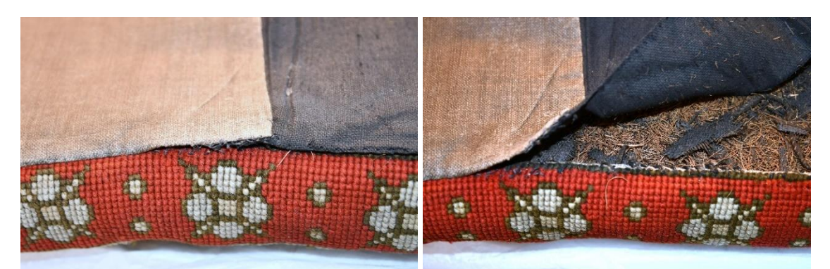
Releasing the back panels from long altar kneeler 1