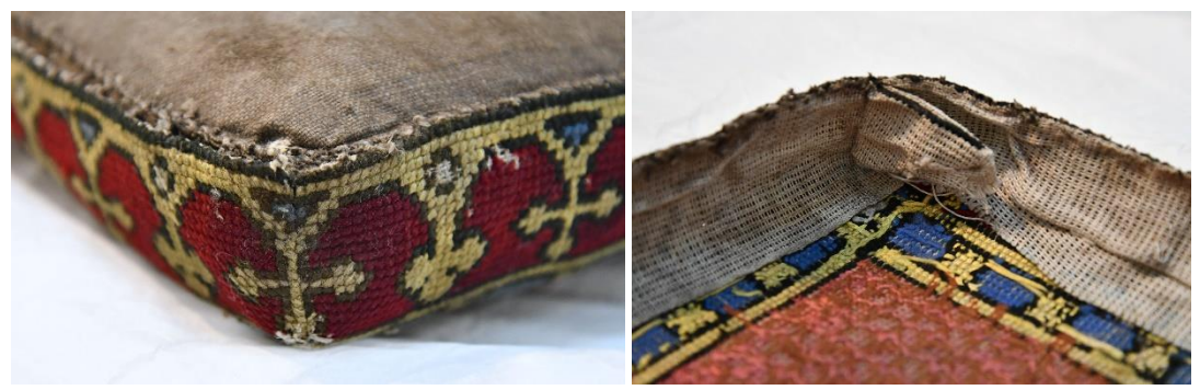
Releasing canvaswork top cover from pew kneeler 2