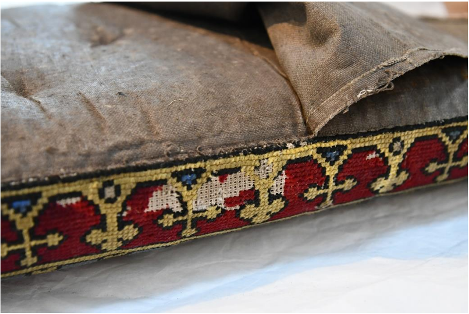
Upper back layer of pew kneeler 2 being removed