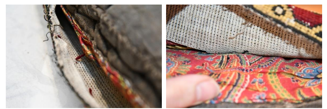
Paisly fabric beneath top cover