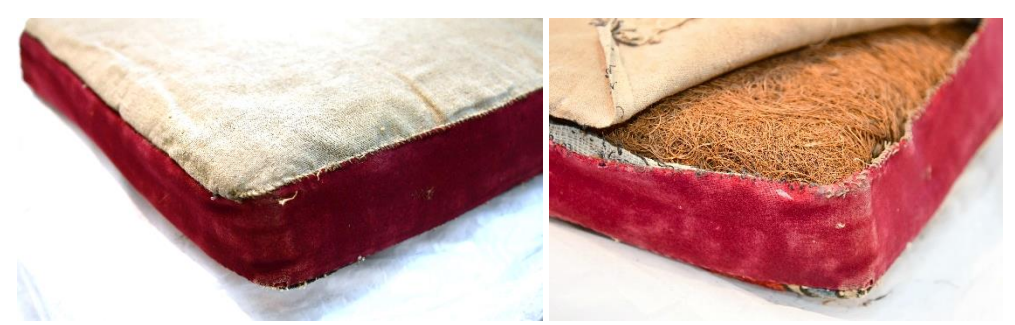
Linen back panel of medium altar kneeler before and during dismantling