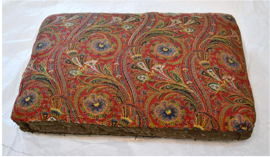
Paisley print fabric layer on pad of pew kneeler 2