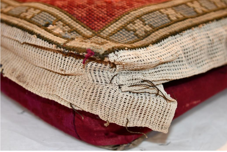
Detail of stitching at corners of canvaswork of long altar kneeler 1