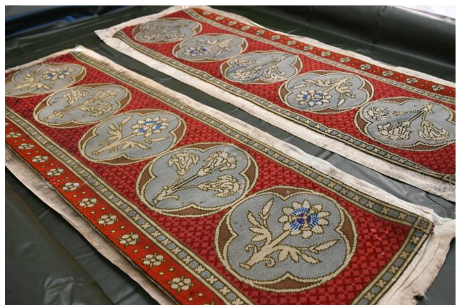
Long altar kneeler top covers after dismantling