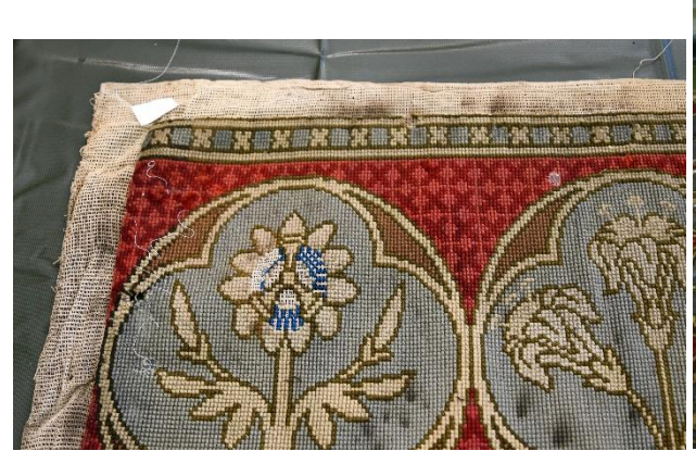
Detail of corner of long kneeler before washing

The drops of wax on large kneelers were removed mechanically. The final traces of wax in the weave were activated and removed with a heated spatula and absorbent paper.