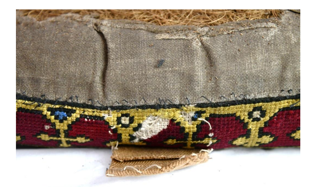
Damaged embroidery beneath tape patch