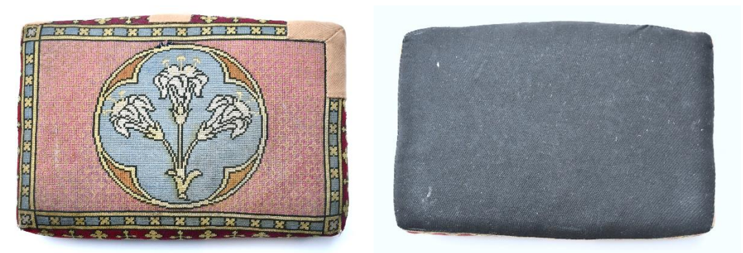
Front and back of pew kneeler 1 before dismantling