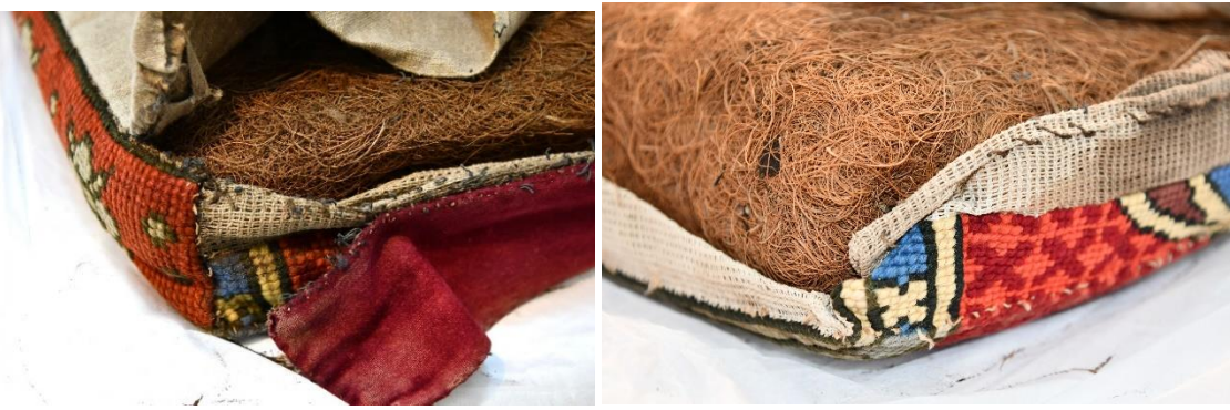
Removal of red wool long side panel from medium altar kneeler