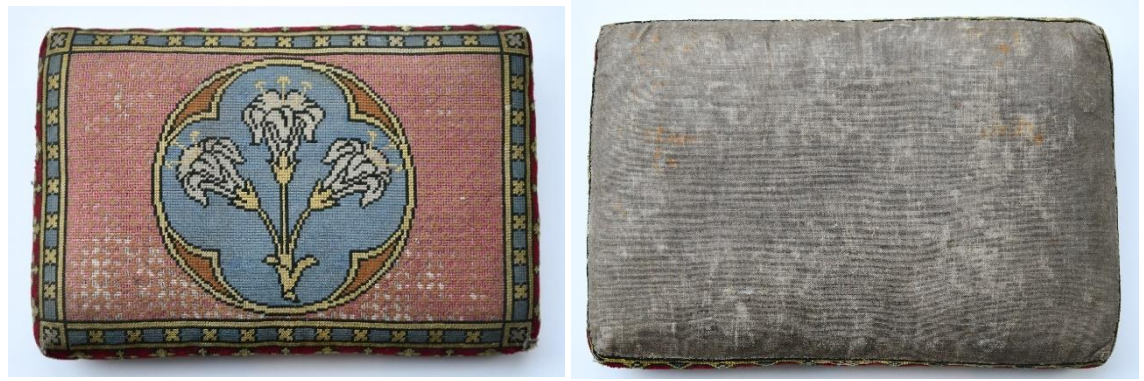
Pew kneeler 2 front and back before dismantling