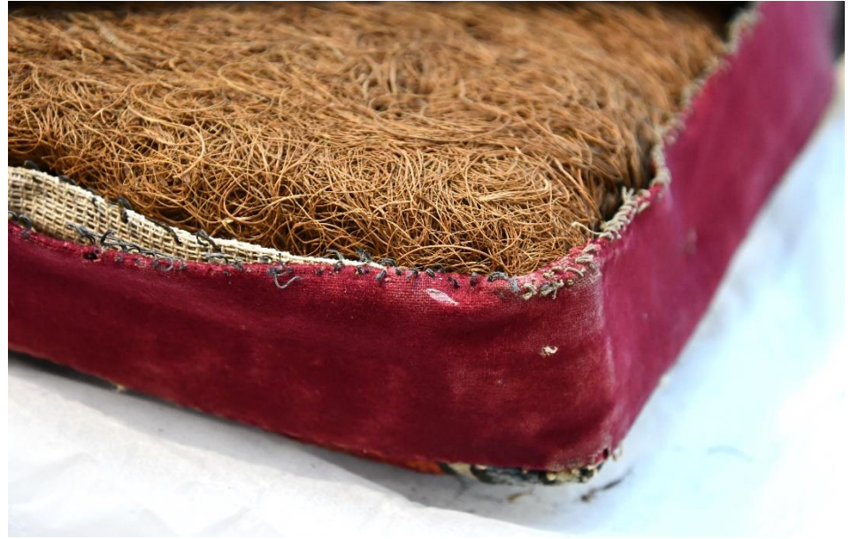
Detail after removal of back panel from medium altar kneeler