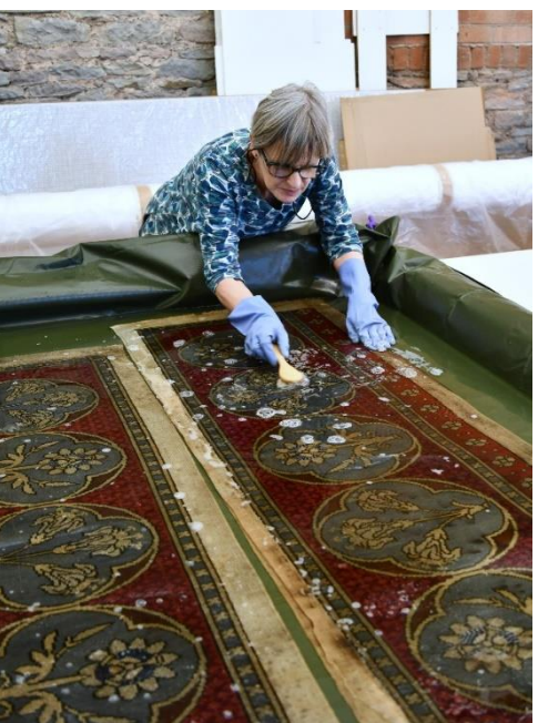
Wet cleaning in progress