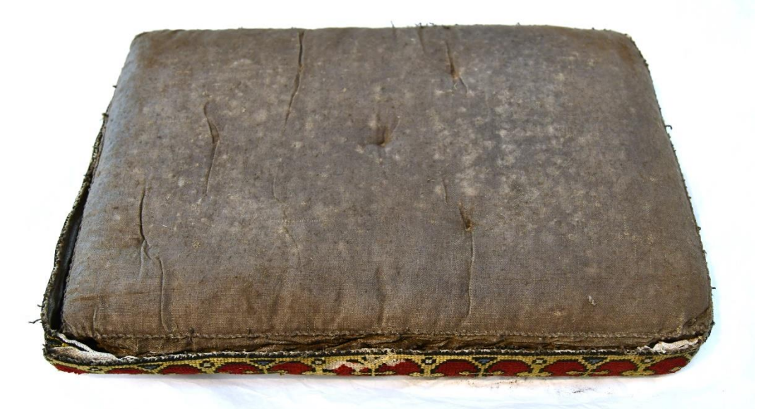
Buttoned inner back layer of pew kneeler 2