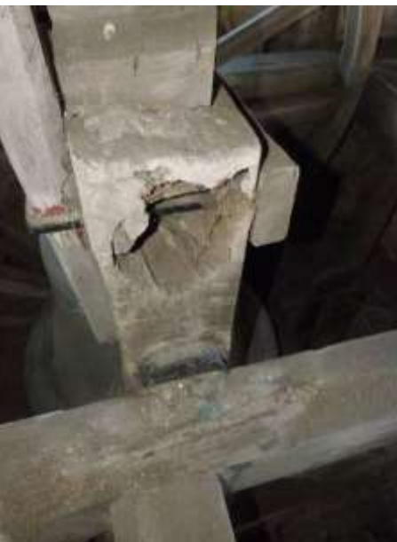
The bells with their derelict fittings and rot at the end of the headstocks