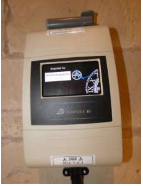
The control unit mounted on the West wall adjacent to the tower doorway and a close up of the Apollo III control unit. These units now have touch screen operation.

I consider that the specification as set out by Whites of Appleton dated 7<sup>th</sup> December 2020 and which formed the basis of the Faculty has been complied with. The church now has a system of using their bells easily and still has the facility to safely chime them using bell ropes should they desire.