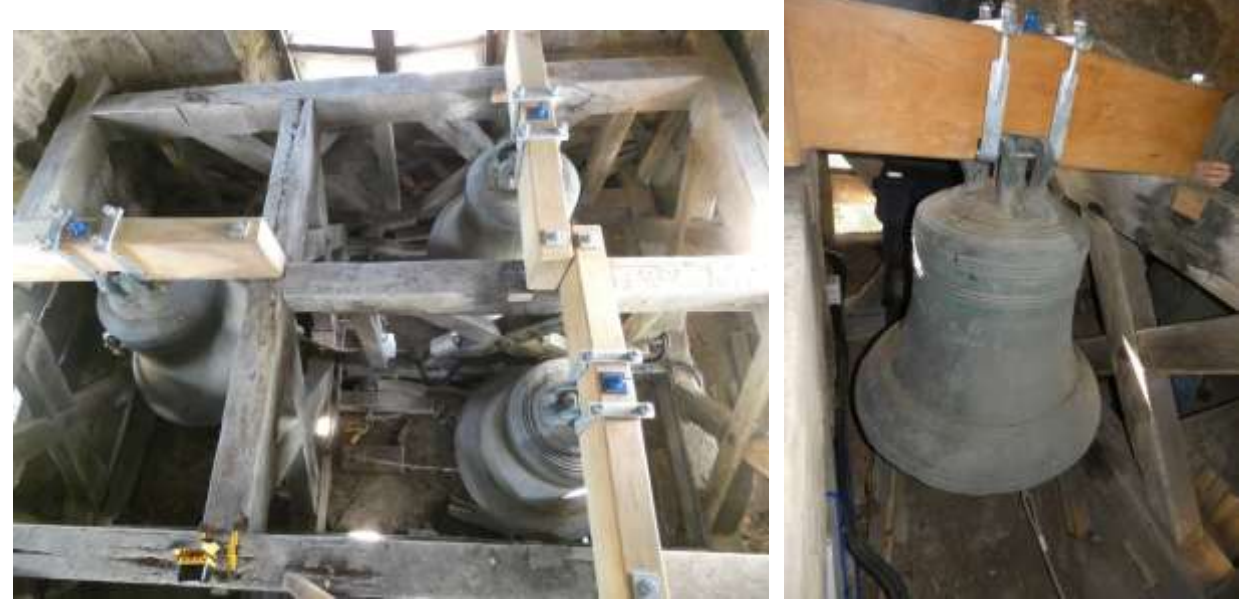
The new "dead stocks" of sepele fitted after the bells had been drilled for centre holes and the cast in staples removed as much as possible. Also the new galvanised supporting ironwork.