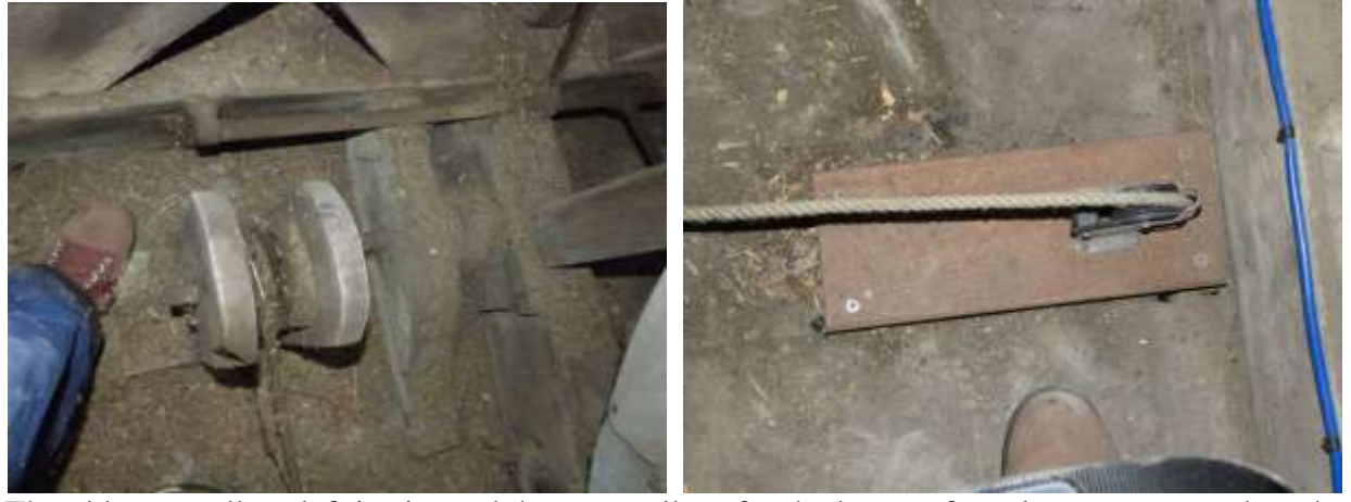
The old rope pulleys left in situ and the new pulleys for the lever safety clappers mounted on the floor. These pulleys are from the Bartol range designed for marine usage.