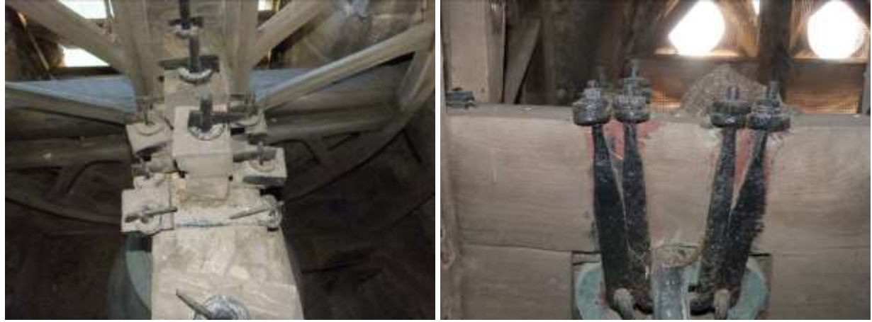
Wedge bolts and old blacksmiths strap bolts. (Only the visible parts had been painted!)