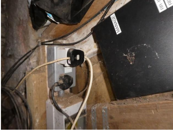
Power and control box with RCD.