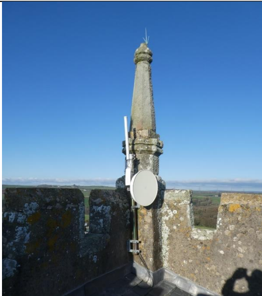
Position of mounting pole for transmitters