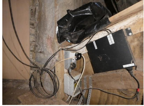
Equipment protected with polythene. Ply and protection will need to be checked regularly for decay.