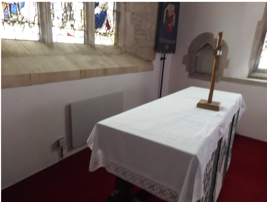
Electric panel heater installed behind an altar

If you would like to discuss panel heaters with a church in the diocese that already makes use of them, please contact the diocese.