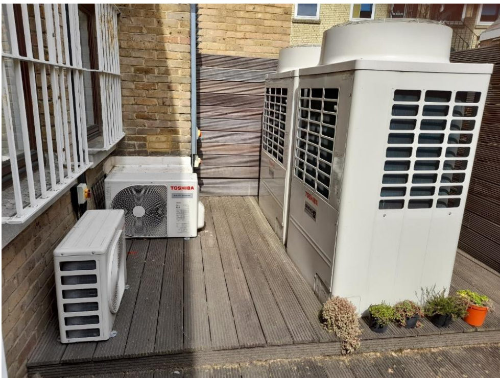
Examples of external units for ASHP comprising of three smaller 3kW units and two larger 10kW units.

AASHPs require the installation of external units which look like air conditioning modules in well ventilated external locations. These external units will need an electricity supply and pipework running from them to the heating system. They will also need a drain nearby as the back of the units can build up moisture, which condenses and sometimes freezes on the coils. The larger units do create some low-level noise and therefore the location and baffling of the units may need to be considered carefully.