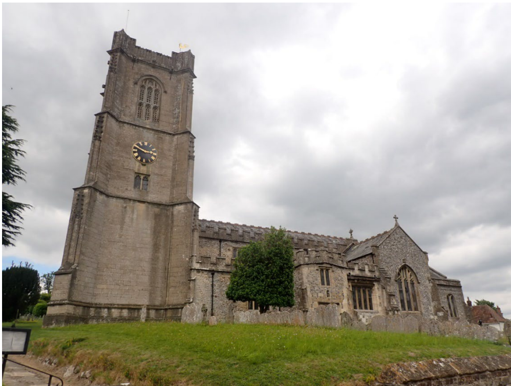
St Michael's Church, Aldbourne PCC of St Michael's