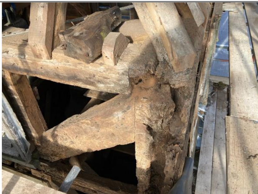
Image taken after the repair work