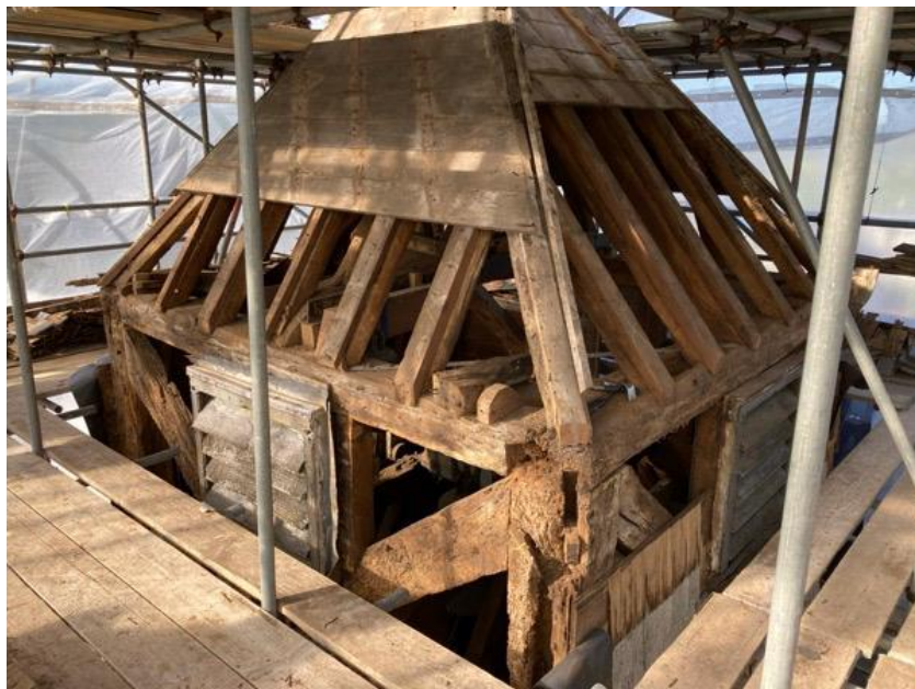
Image taken after the repair work