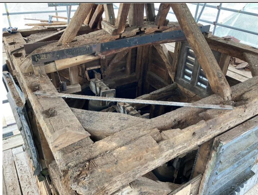
Image taken after the repair work