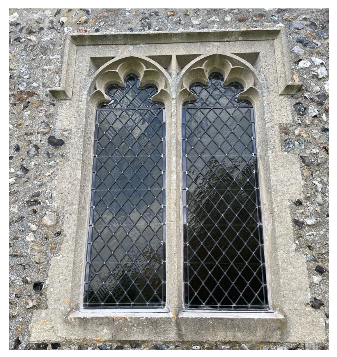
Figure 1 - North Window of North Aisle

It should be noted that since the windows have been left open the church is noticeably airier and less fusty and the smell of damp has disappeared.