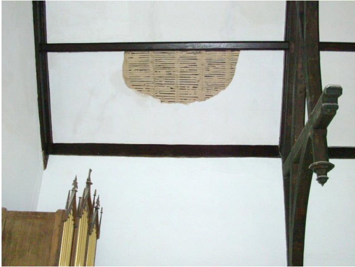
Nave Ceiling –plaster fall: