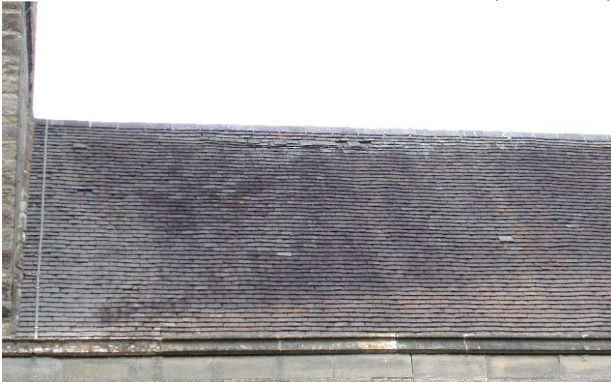
Roof work in progress: