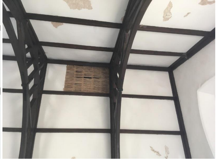
Chancel ceiling - plaster fall, after testing: