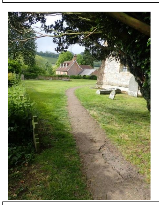
Plate 2: Pre-groundworks, from the north-east