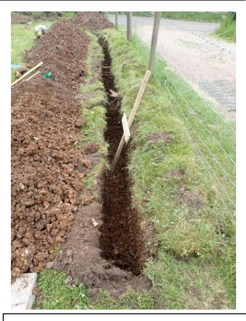
Plate 67: Excavation of the water pipe trench, from the east