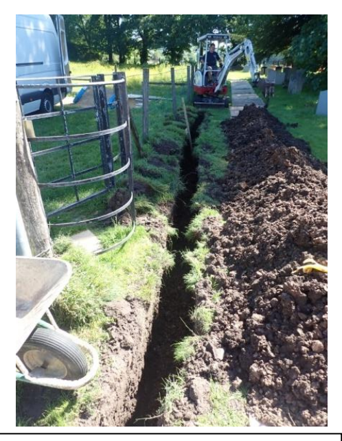
Plate 81: Excavation of the water pipe trench, from the west