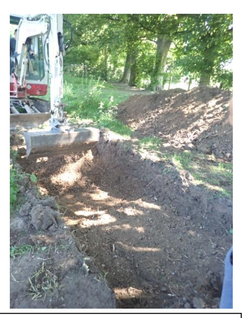
Plate 105: Excavations for the septic tank, from the south