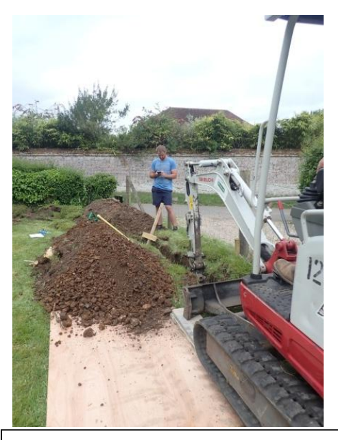
Plate 63: Excavation of the water pipe trench, from the east