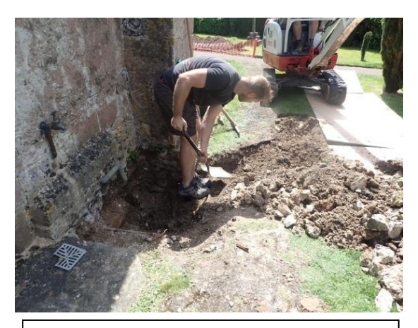
Plate 32: Excavation of the cable trench, from the north