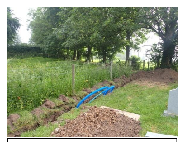
Plate 97: Excavation of the water pipe trench, from the south-west