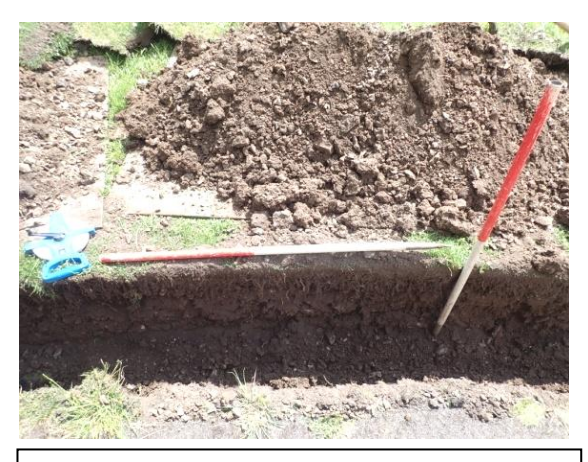
Plate 12: Representative Section 2, from the north-west