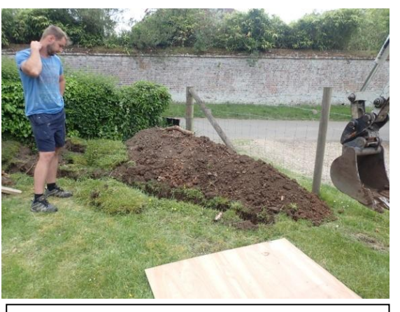
Plate 59: Excavation of the water pipe trench, from the south-east