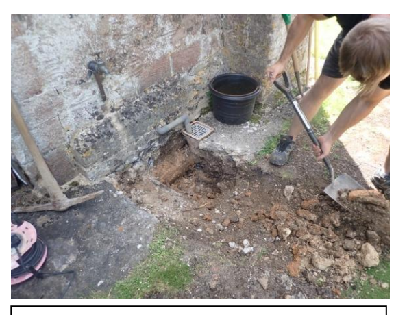
Plate 27: Hand excavations at the west wall of the west tower, from the north