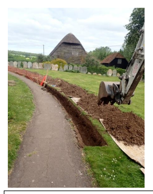
Plate 20: Excavation of the cable trench, from the west