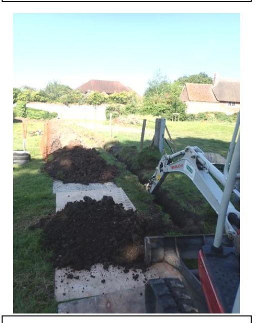
Plate 77: Excavation of the water pipe trench, from the east