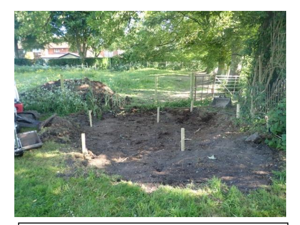
Plate 48: Excavated toilet block site, from the south