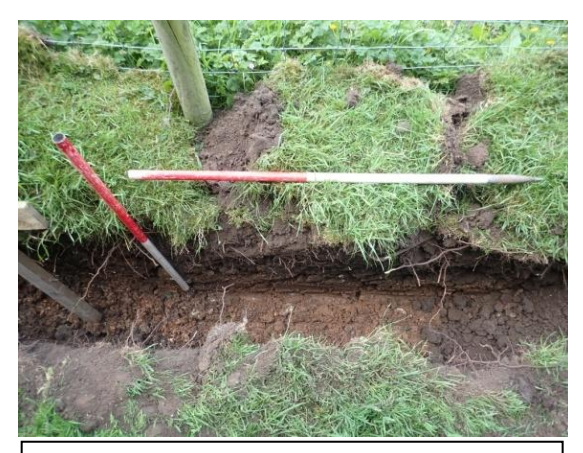
Plate 87: Representative Section 14, from the south