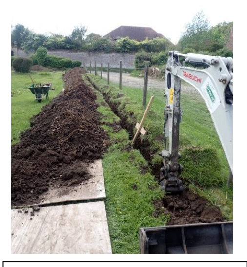
Plate 74: Excavation of the water pipe trench, from the east