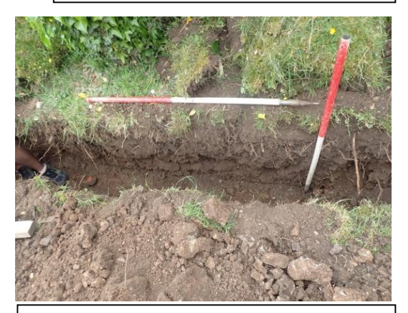
Plate 58: Representative Section 8, from the east