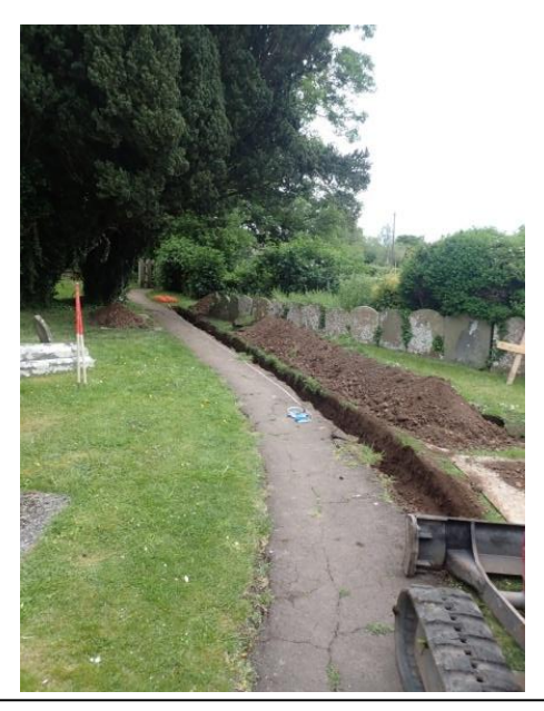
Plate 11: Excavation of the cable trench, from the south-west