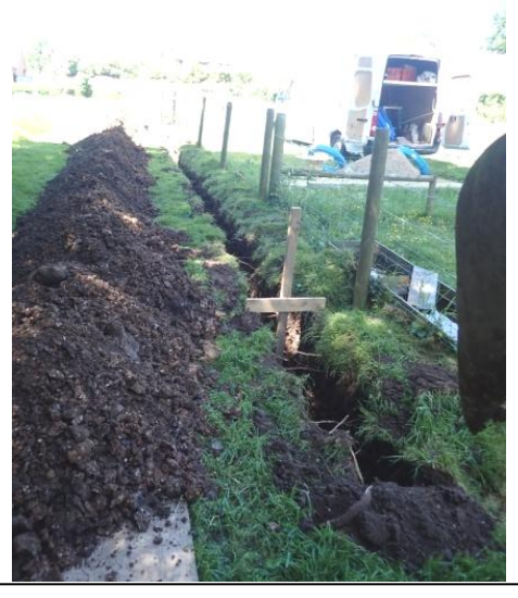
Plate 85: Excavation of the water pipe trench, from the east