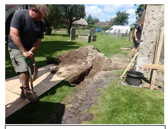
Plate 34: Excavation of the cable trench, from the south