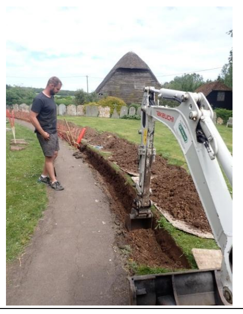
Plate 18: Excavation of the cable trench, from the west

Plate 17: Excavation of the cable trench, from the west