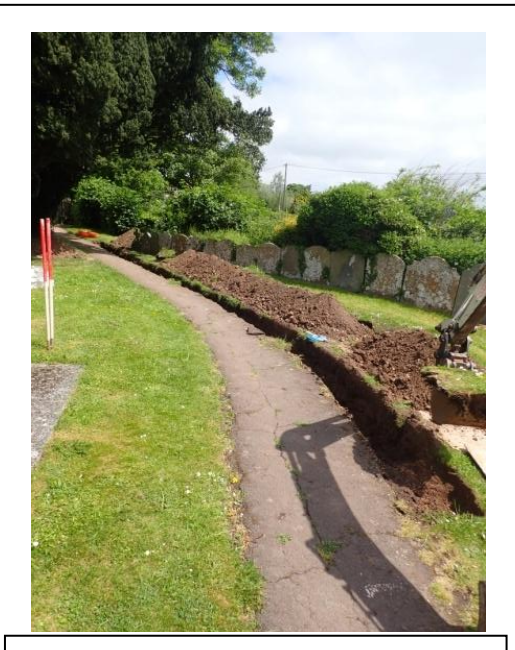
Plate 13: Excavation of the cable trench, from the south-west