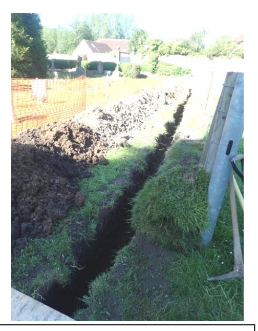
Plate 78: Excavation of the water pipe trench, from the east