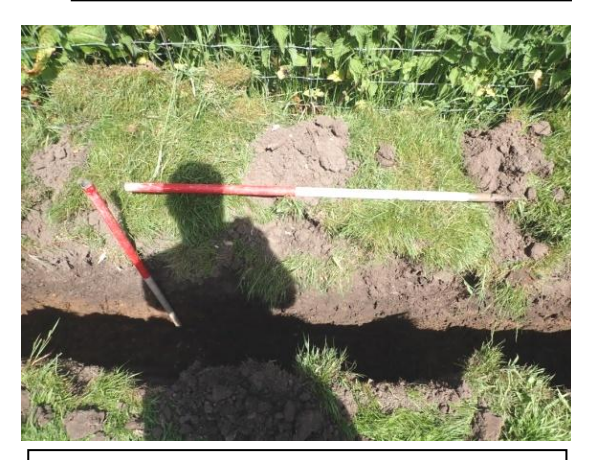
Plate 91: Section 15 of pit cut [004] with fill (005), from the south