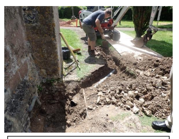
Plate 33: Excavation of the cable trench, from the north