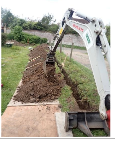
Plate 69: Excavation of the water pipe trench, from the east