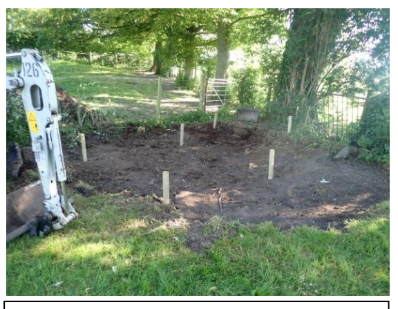
Plate 49: Excavated toilet block site, from the south

Plate 48: Excavated toilet block site, from the south