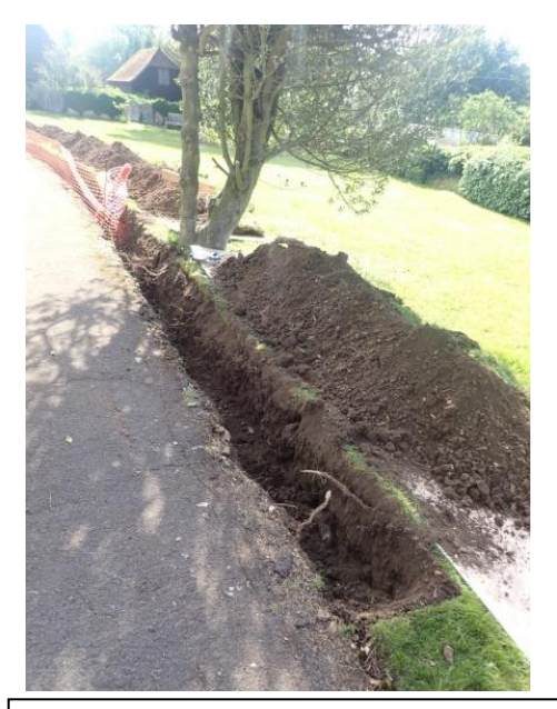
Plate 24: Excavation of the cable trench, from the west