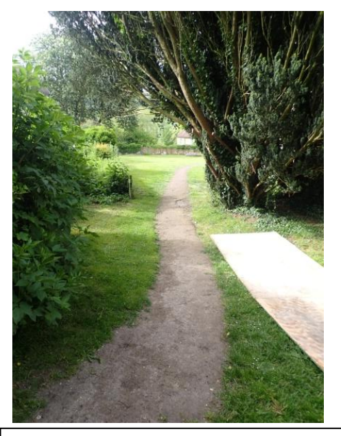
Plate 1: Pre-groundworks, from the north