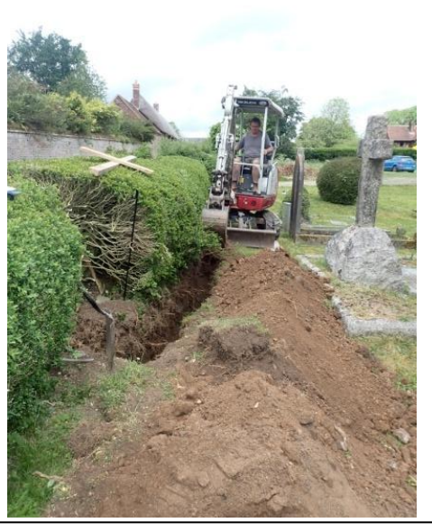
Plate 54: Excavation of the water pipe trench, from the south