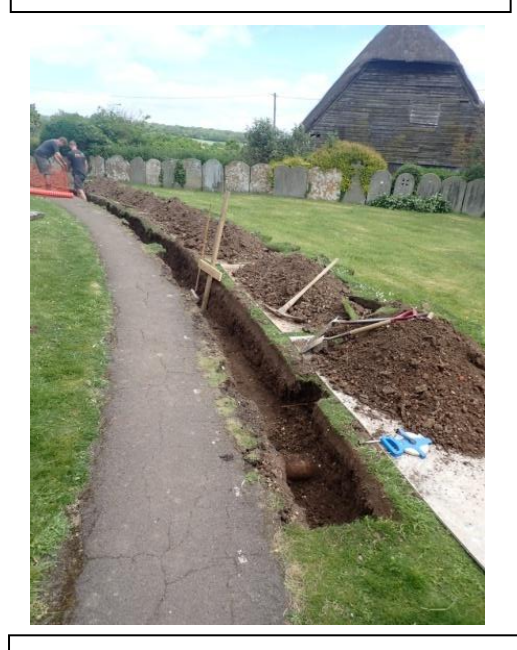
Plate 17: Excavation of the cable trench, from the west