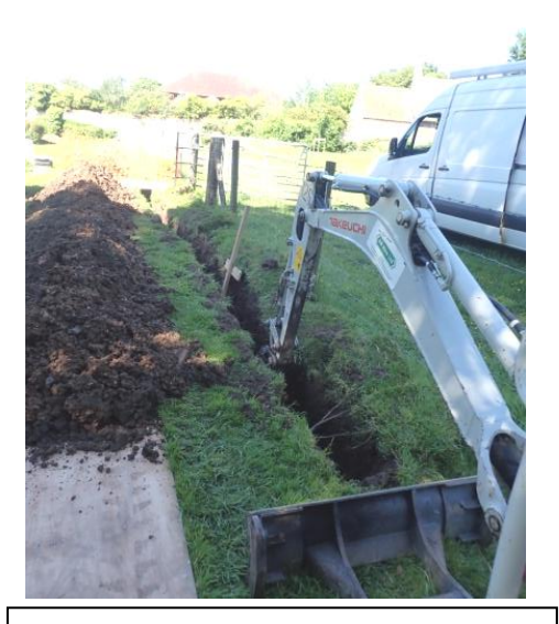
Plate 82: Excavation of the water pipe trench, from the east