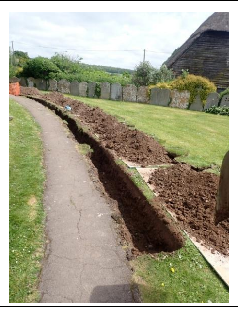
Plate 15: Excavation of the cable trench, from the west