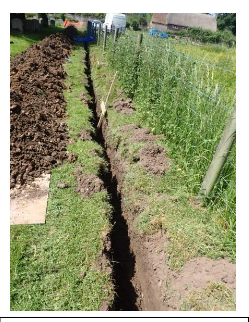
Plate 93: Excavation of the water pipe trench, from the east