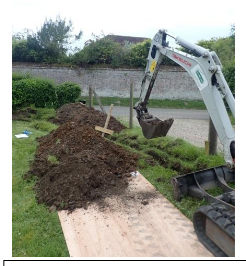
Plate 62: Excavation of the water pipe trench, from the east