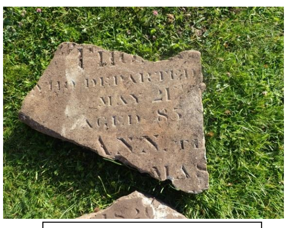
Plate 114: Grave slab fragment