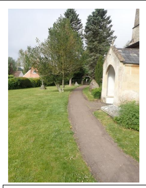
Plate 4: Pre-groundworks, from the east