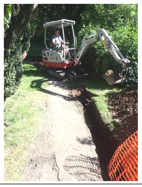
Plate 38: Excavation of the cable trench, from the south