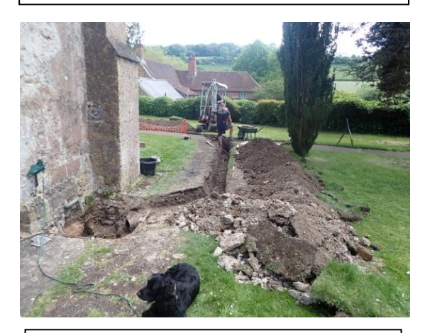
Plate 37: Excavation of the cable trench, from the north