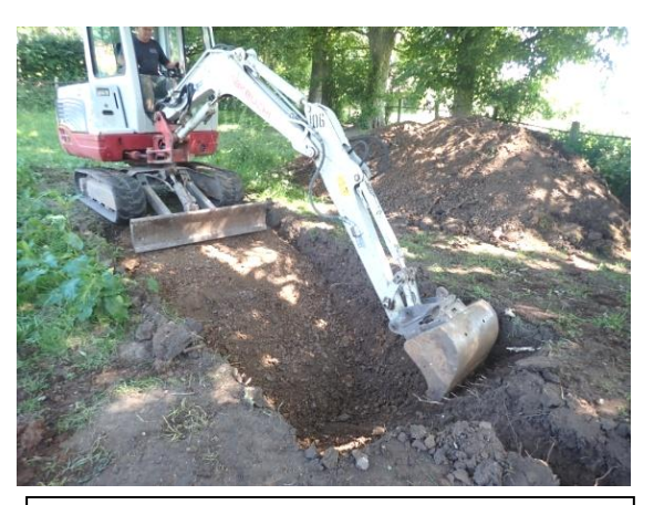
Plate 111: Excavations for the septic tank, from the south-west