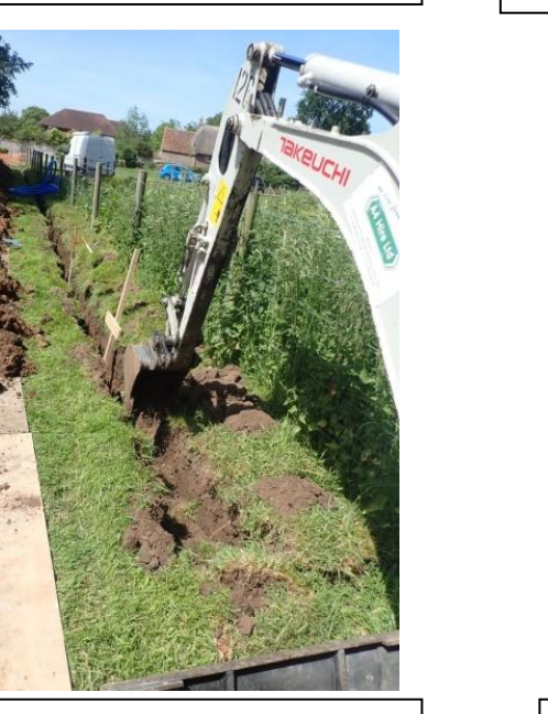
Plate 92: Excavation of the water pipe trench, from the east