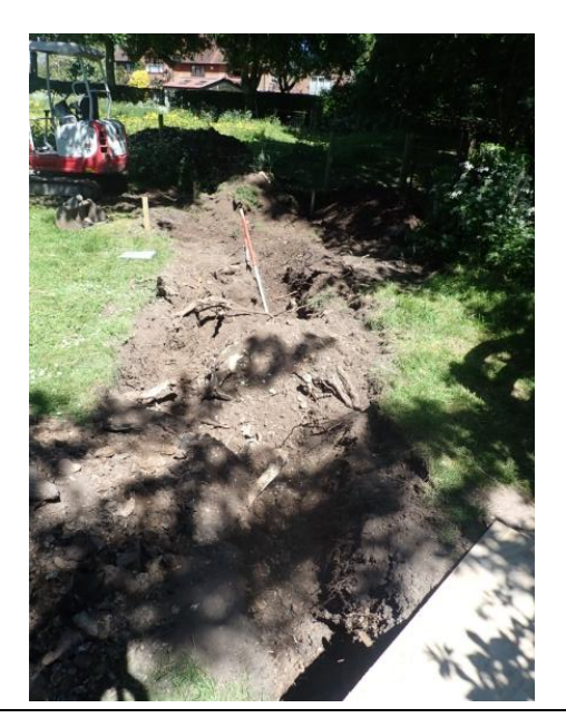
Plate 46: Excavation of the cable trench, from the south