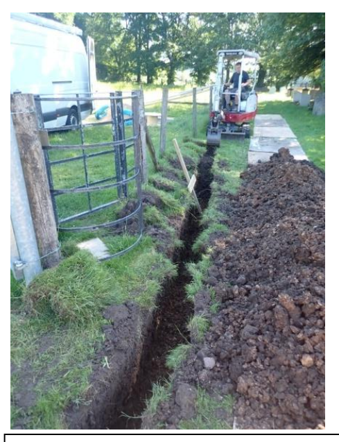
Plate 80: Excavation of the water pipe trench, from the west