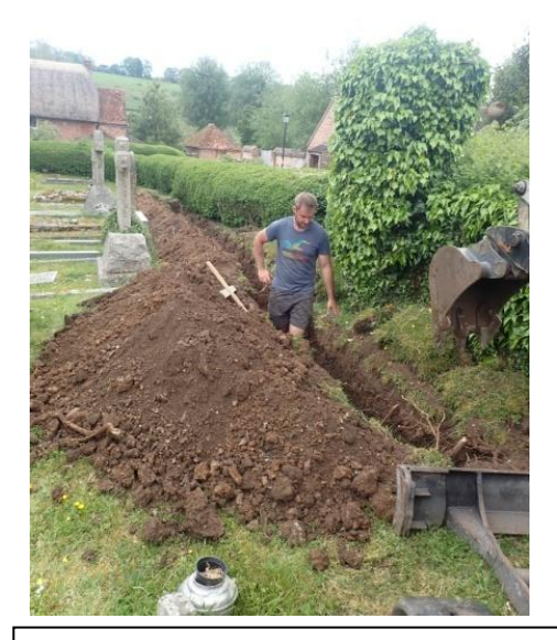
Plate 57: Excavation of the water pipe trench, from the north