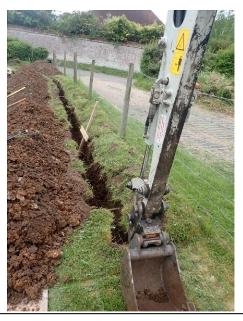
Plate 70: Excavation of the water pipe trench, from the east