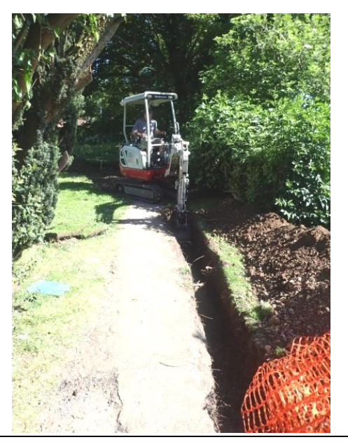
Plate 39: Excavation of the cable trench, from the south