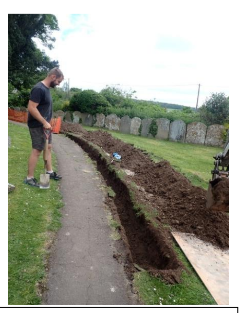
Plate 14: Excavation of the cable trench, from the west