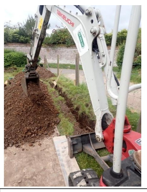
Plate 64: Excavation of the water pipe trench, from the east