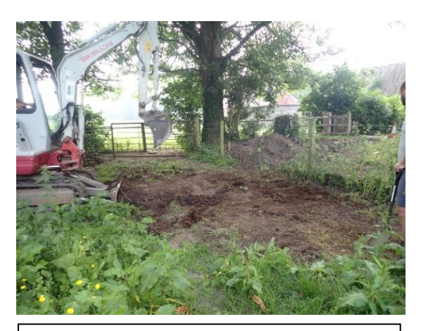
Plate 100: Excavations for the septic tank, from the south-west