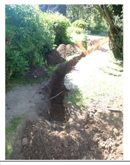
Plate 42: Excavation of the cable trench, from the south