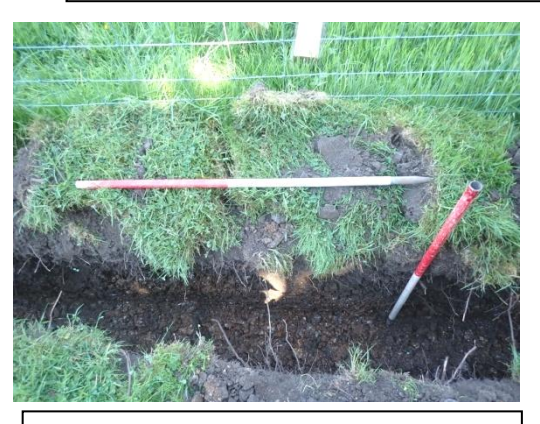
Plate 84: Representative Section 13, from the south