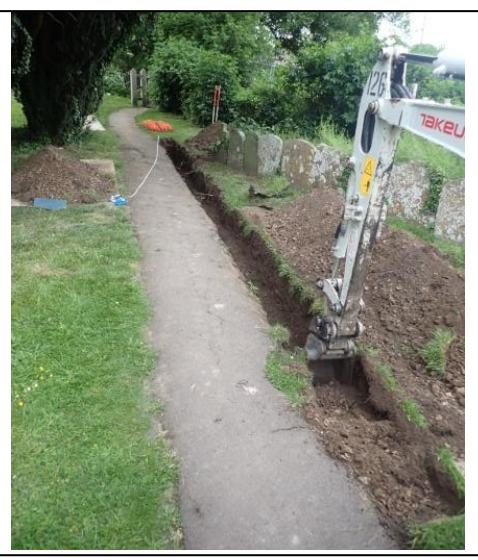
Plate 10: Excavation of the cable trench, from the south-west