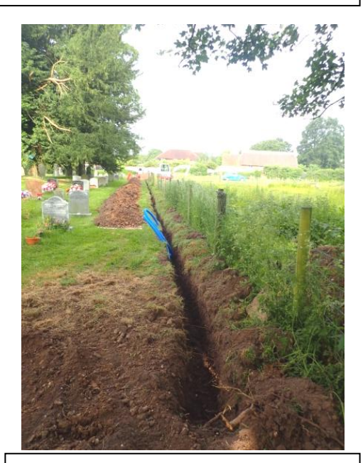
Plate 98: Excavation of the water pipe trench, from the east