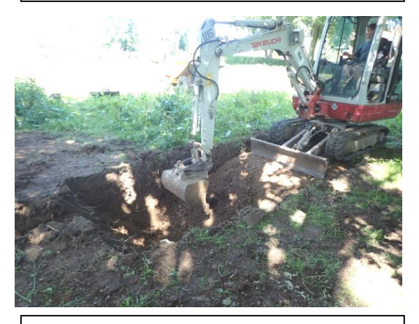
Plate 112: Excavations for the septic tank, from the east

19th century Grave Slab Fragments recovered from the Electricity Cable Trench Excavation