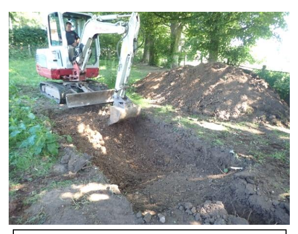
Plate 108: Excavations for the septic tank, from the south-west