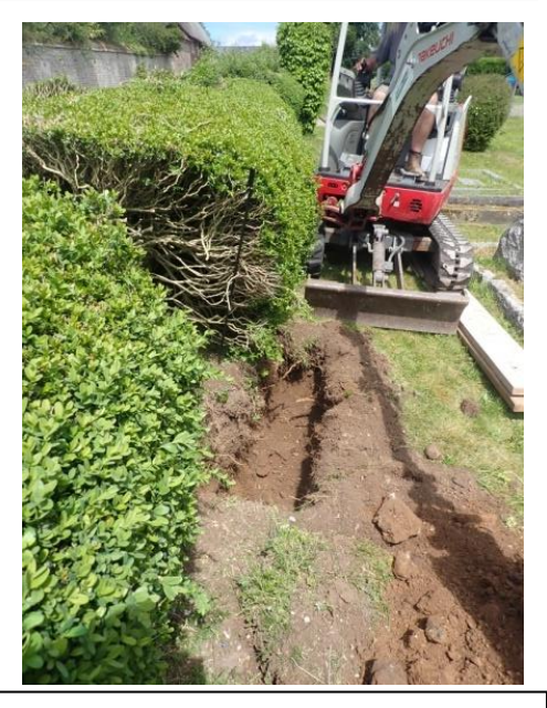
Plate 53: Excavation of the water pipe trench, from the south