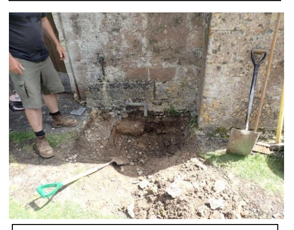
Plate 29: Hand excavations at the west wall of the west tower, from the west