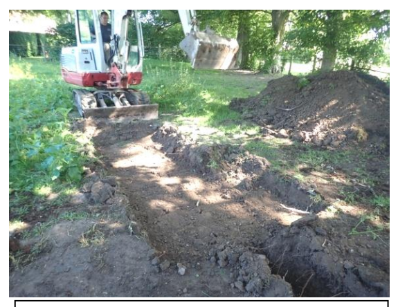
Plate 102: Excavations for the septic tank, from the south