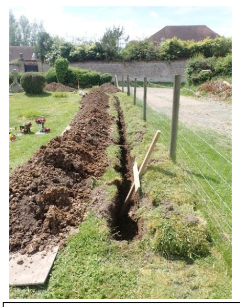
Plate 71: Excavation of the water pipe trench, from the east