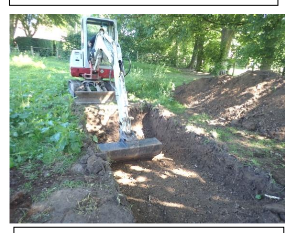
Plate 104: Excavations for the septic tank, from the south