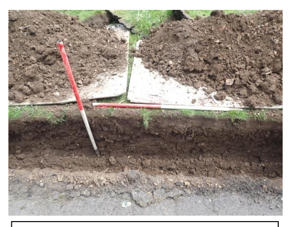
Plate 19: Representative Section 3, from the north