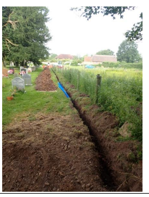
Plate 99: Excavation of the water pipe trench, from the east