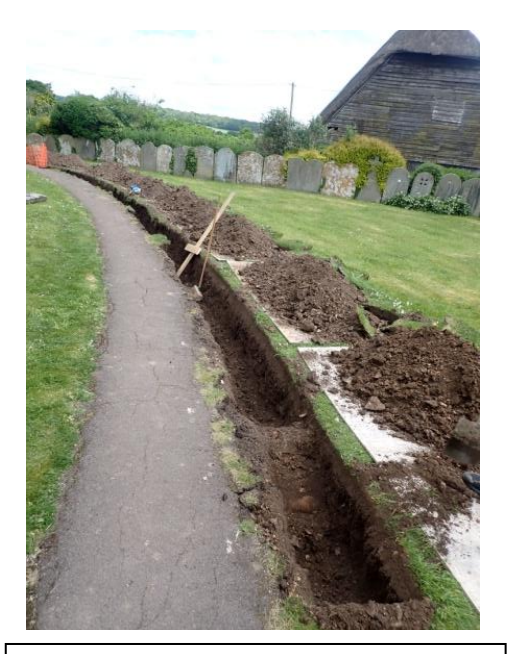
Plate 16: Excavation of the cable trench, from the west