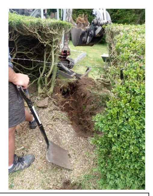
Plate 52: Excavation of the water pipe trench, from the west