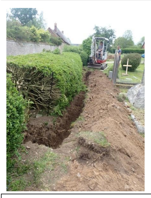
Plate 55: Excavation of the water pipe trench, from the south