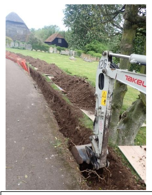
Plate 23: Excavation of the cable trench, from the west