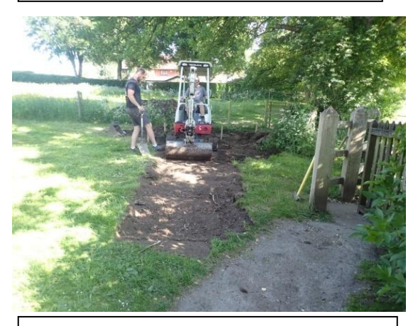
Plate 45: Excavation of the cable trench, from the south