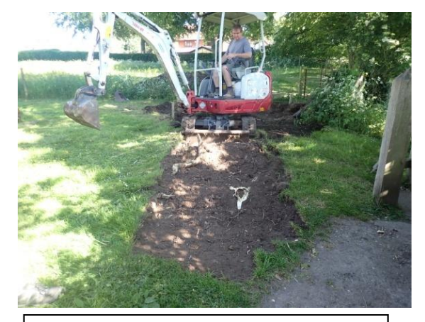
Plate 44: Excavation of the cable trench, from the south