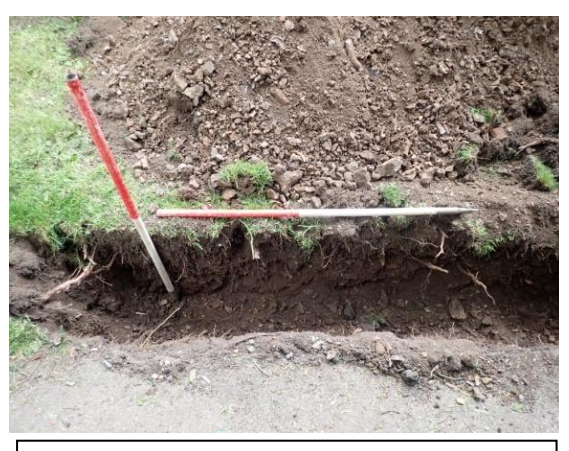
Plate 8: Representative Section 1, from the west