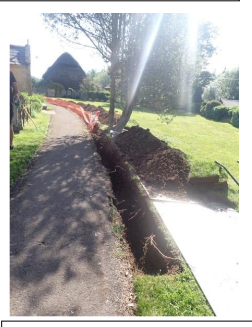
Plate 26: Excavation of the cable trench, from the west