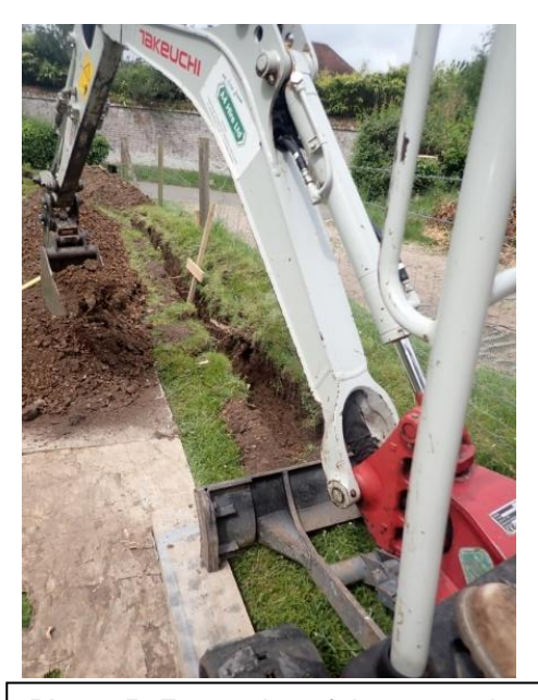
Plate 65: Excavation of the water pipe trench, from the east