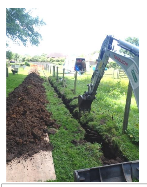
Plate 88: Excavation of the water pipe trench, from the east