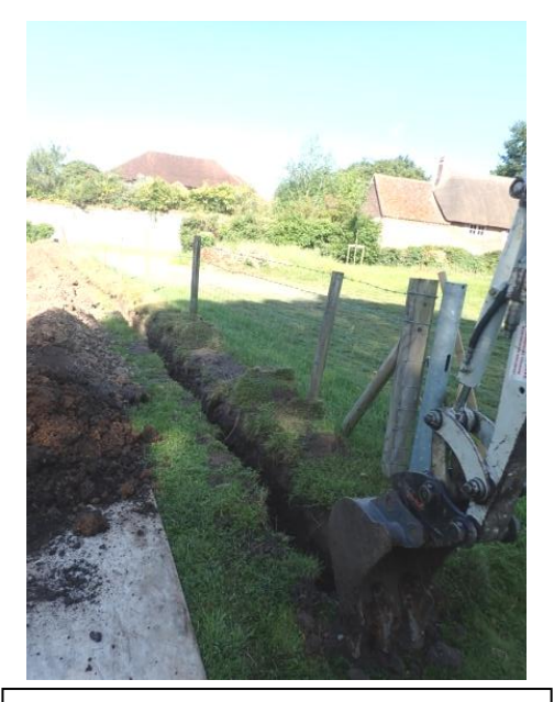
Plate 76: Excavation of the water pipe trench, from the east