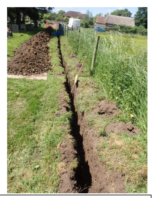
Plate 96: Excavation of the water pipe trench, from the east