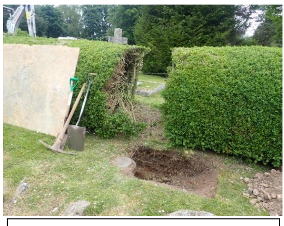
Plate 51: Excavation of the water pipe trench, from the west