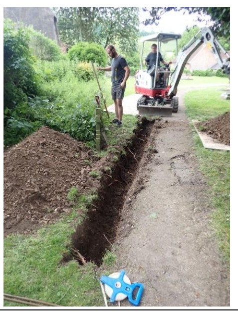
Plate 9: Excavation of the cable trench, from the north