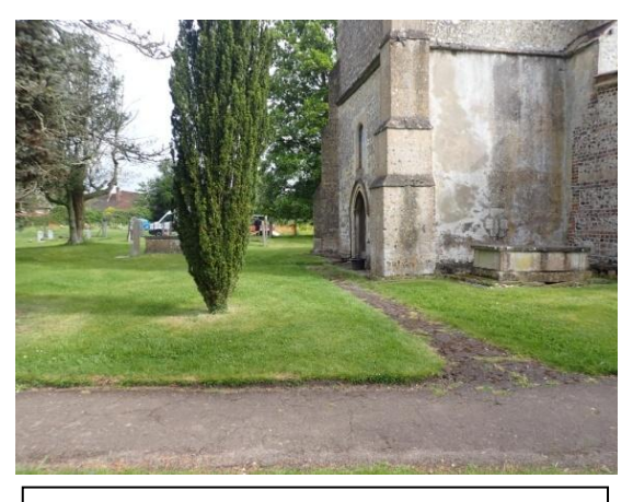
Plate 6: Pre-groundworks, from the south