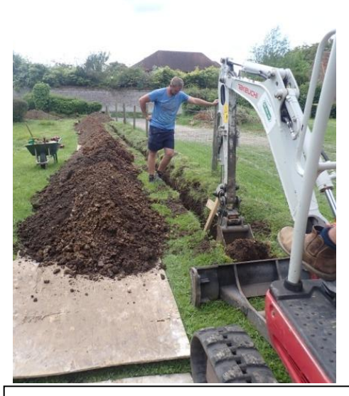
Plate 72: Excavation of the water pipe trench, from the east