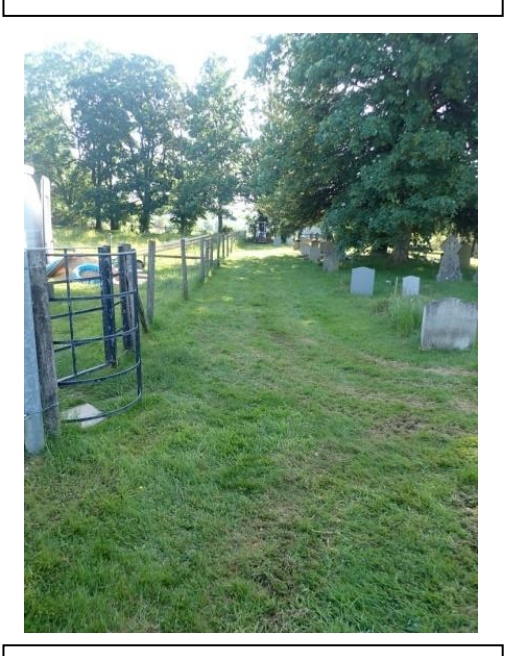
Plate 75: Pre-groundworks, from the west