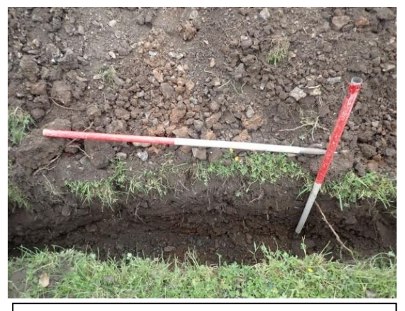
Plate 60: Representative Section 9, from the south-east