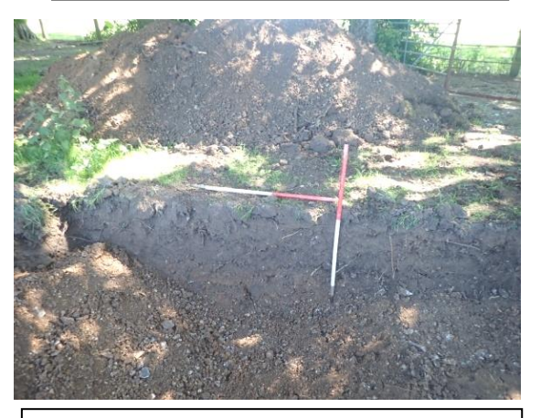
Plate 106: Representative Section 17, from the west