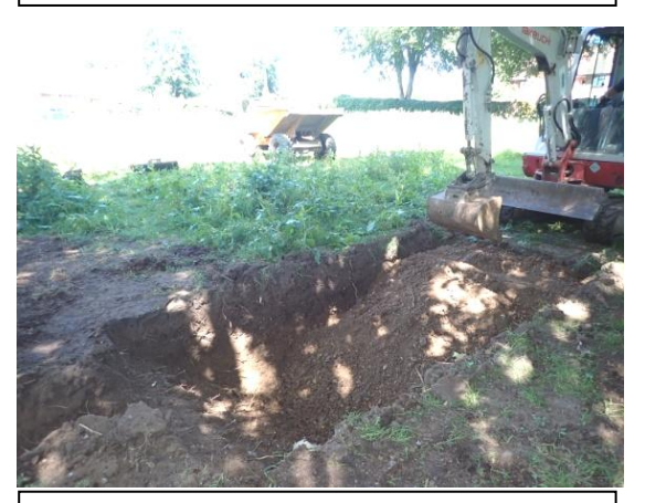
Plate 110: Excavations for the septic tank, from the east