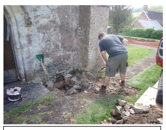
Plate 28: Hand excavations at the west wall of the west tower, from the north