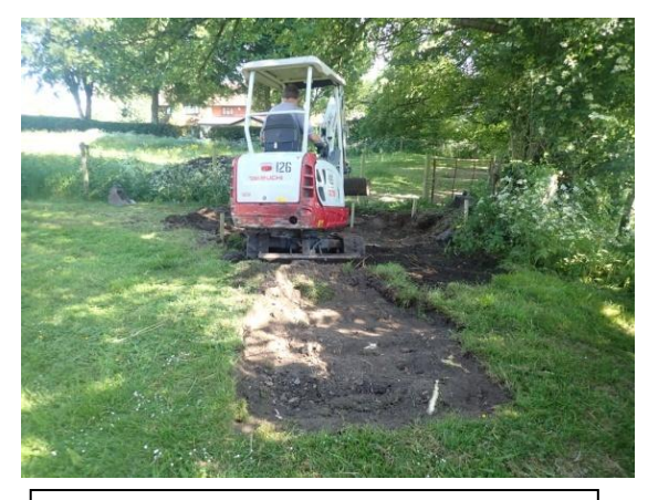
Plate 43: Excavation of the cable trench, from the south