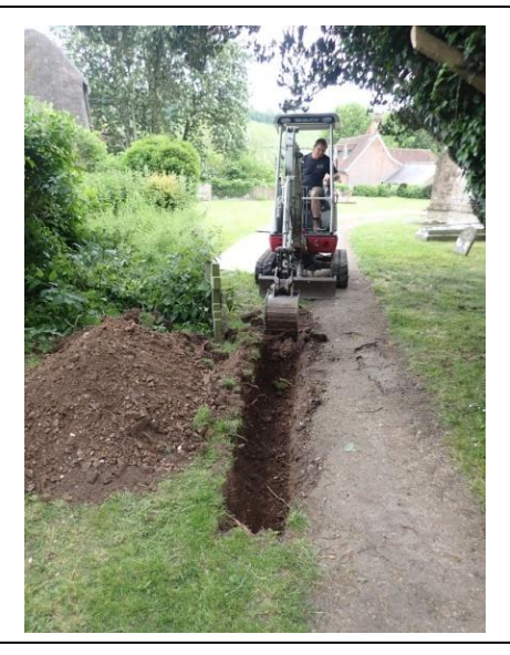
Plate 7: Excavation of the cable trench, from the north