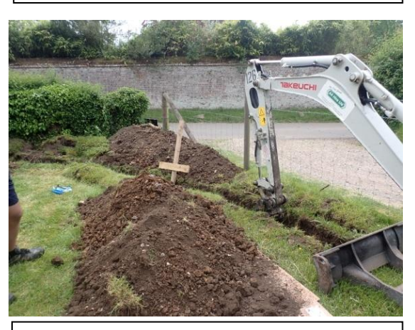
Plate 61: Excavation of the water pipe trench, from the east