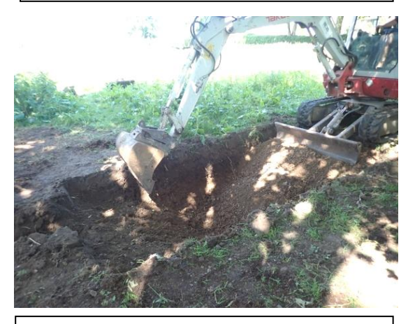
Plate 109: Excavations for the septic tank, from the east