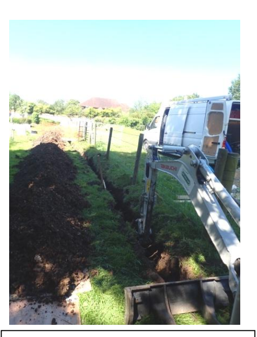
Plate 83: Excavation of the water pipe trench, from the east