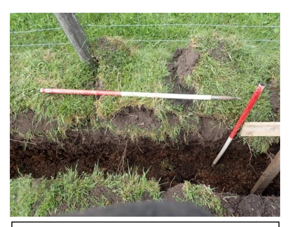
Plate 73: Representative Section 11, from the south