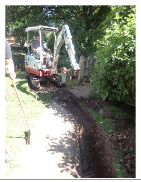
Plate 40: Excavation of the cable trench, from the south