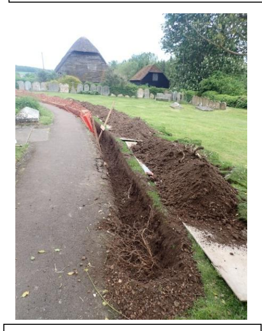
Plate 21: Excavation of the cable trench, from the west