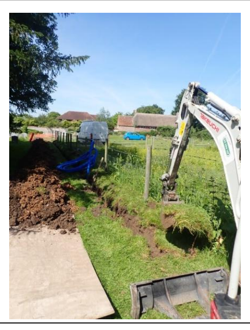
Plate 89: Excavation of the water pipe trench, from the east