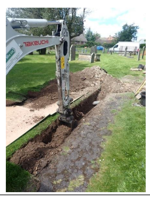
Plate 35: Excavation of the cable trench, from the south