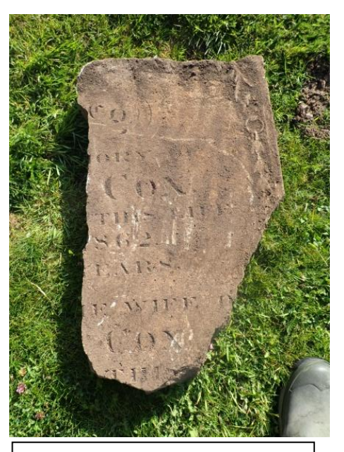
Plate 113: Grave slab fragment

19th century Grave Slab Fragments recovered from the Electricity Cable Trench Excavation