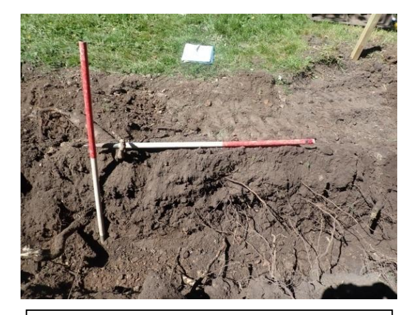
Plate 47: Representative Section 7, from the east