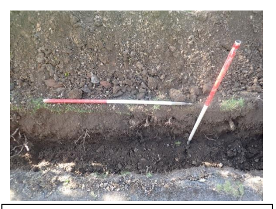
Plate 25: Representative Section 5, from the north