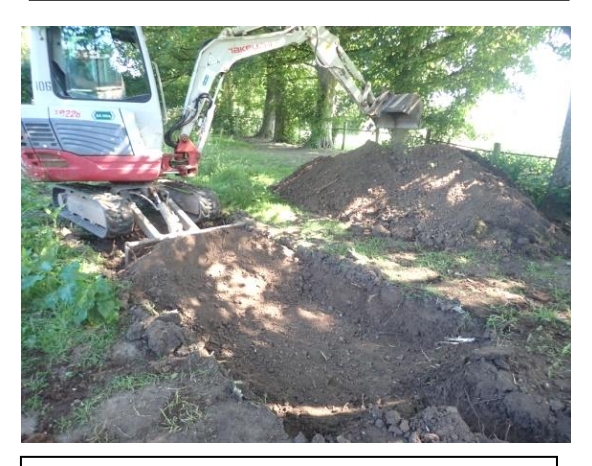
Plate 103: Excavations for the septic tank, from the south-west