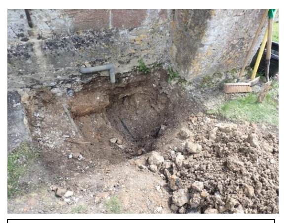
Plate 30: Hand excavations at the west wall of the west tower, from the west