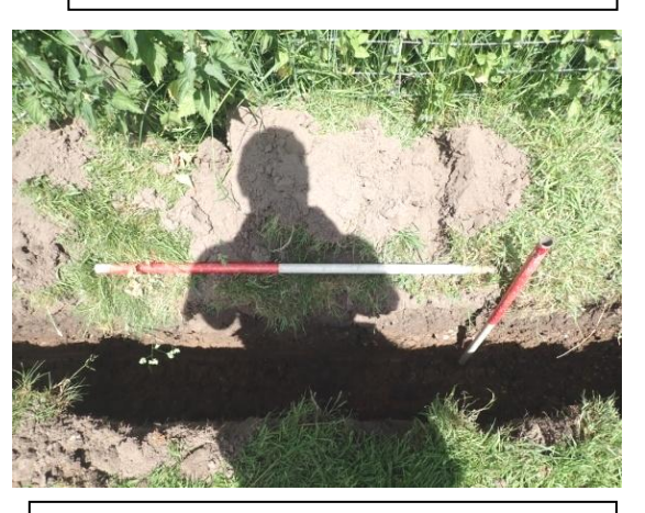
Plate 94: Representative Section 16, from the south