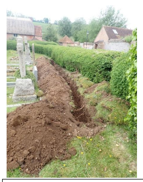
Plate 56: Excavation of the water pipe trench, from the north