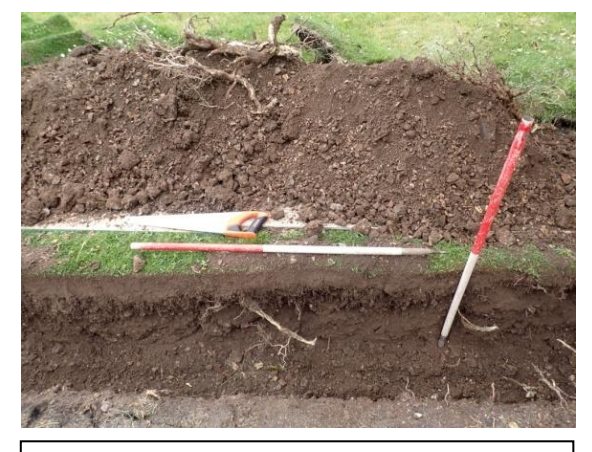
Plate 22: Representative Section 4, from the north

Plate 21: Excavation of the cable trench, from the west