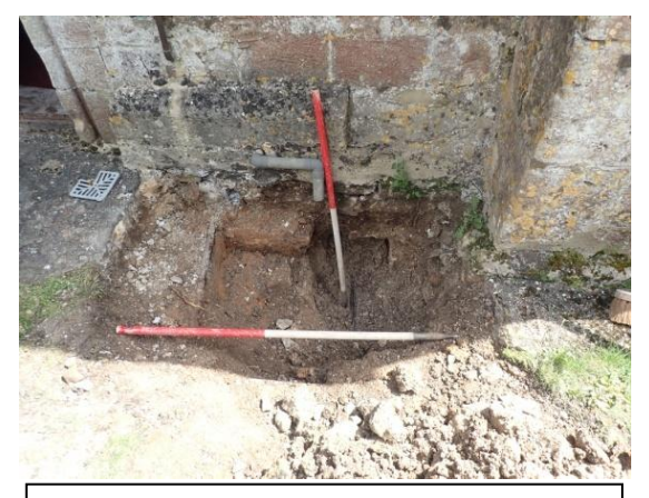
Plate 31: Hand excavations at the west wall of the west tower, from the west