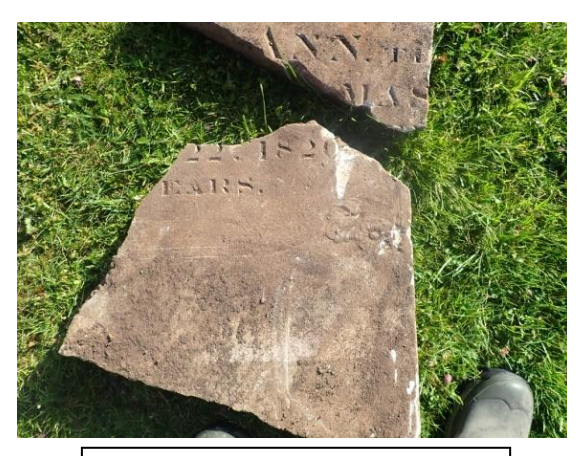
Plate 115: Grave slab fragment