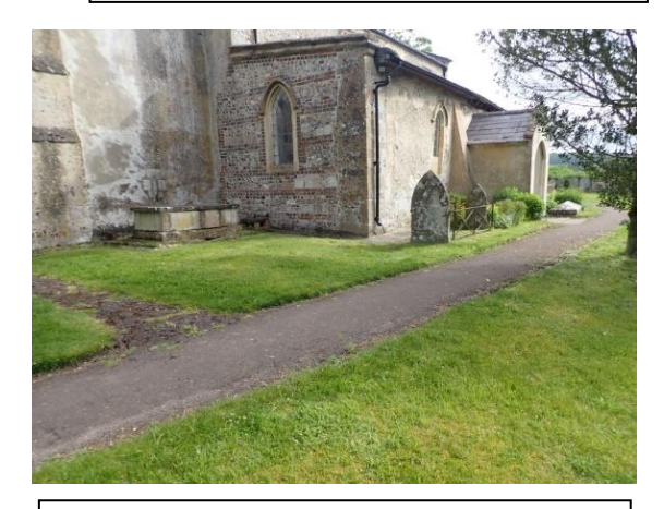
Plate 5: Pre-groundworks, from the south-west