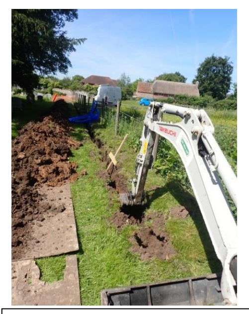
Plate 90: Excavation of the water pipe trench, from the east