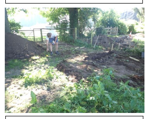
Plate 101: Excavations for the septic tank, from the west