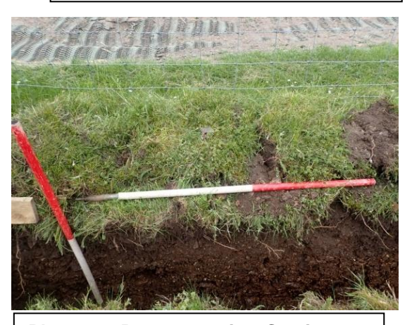
Plate 68: Representative Section 10, from the south