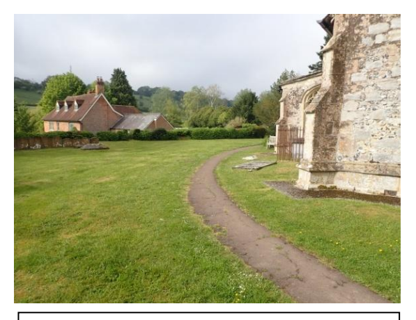
Plate 3: Pre-groundworks, from the northeast