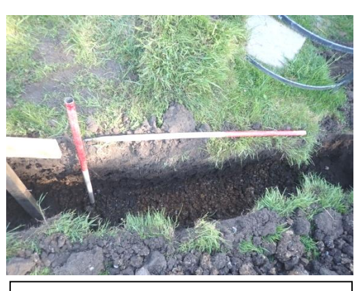
Plate 79: Representative Section 12, from the south