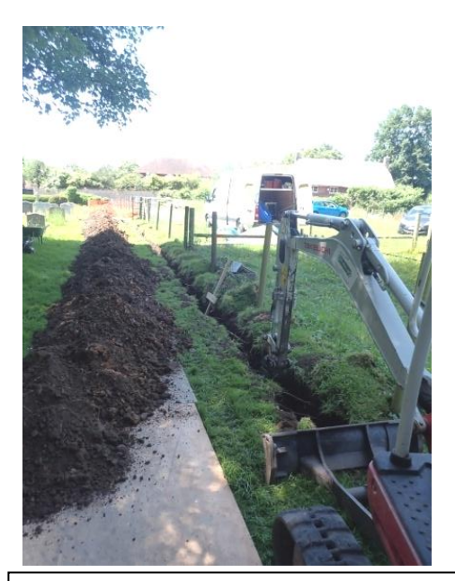
Plate 86: Excavation of the water pipe trench, from the east