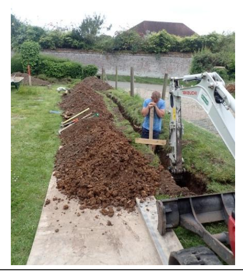
Plate 66: Excavation of the water pipe trench, from the east