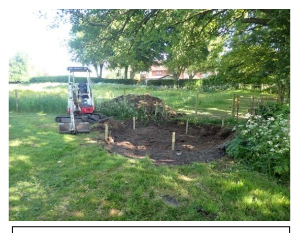
Plate 50: Excavated toilet block site, from the south-east