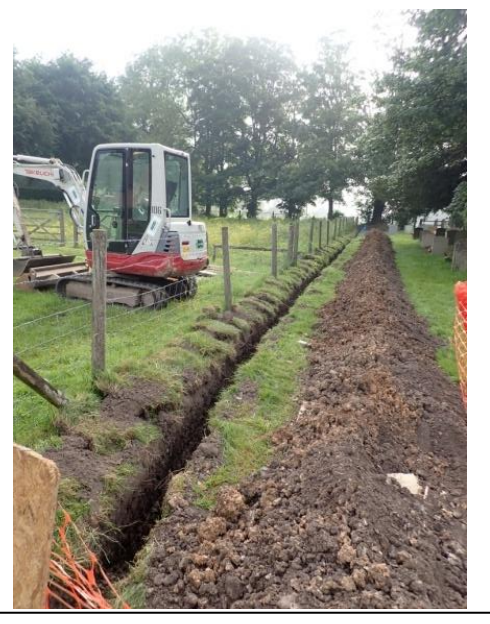
Plate 95: Excavation of the water pipe trench, from the west