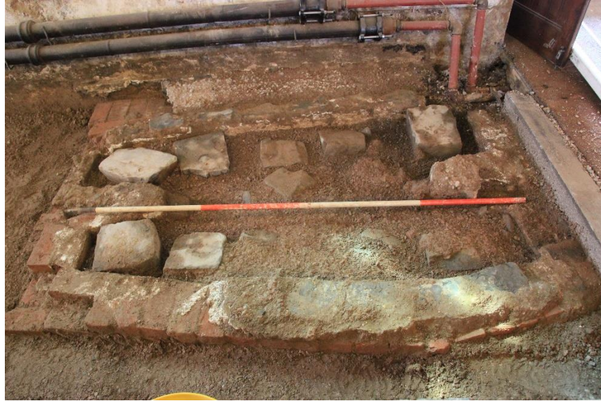
Above: Grave 3 from the north. Scale 2m. Below: Grave 3 from the east. Scales 1m