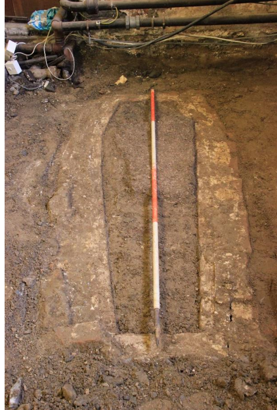
Above left: Initial removal of concrete floor in north aisle showing depth. Above right: Grave 1 from the east. Scale 2m. Below: Grave 2 from the north. Scale 1m