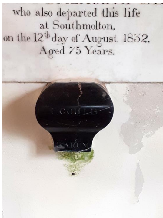
4,5 and 6. Details of the completed monument