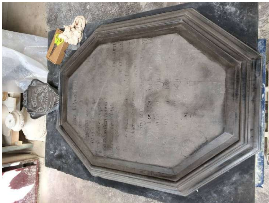
Plaque following waxing with pigmented microcrystalline wax. The original lettering is now more visible.