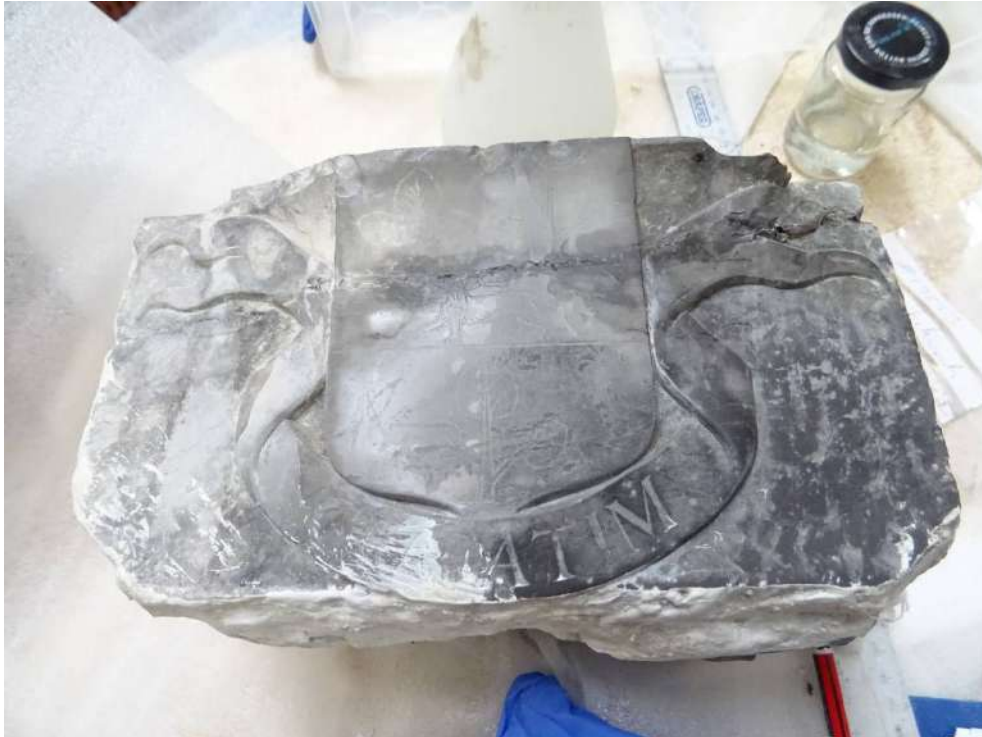
This image shows the corbel after cleaning the right hand side