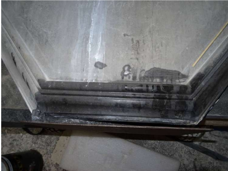
This image shows some of the few remaining fragments of polished stone surface.