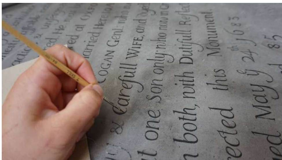
Retouching the lettering.