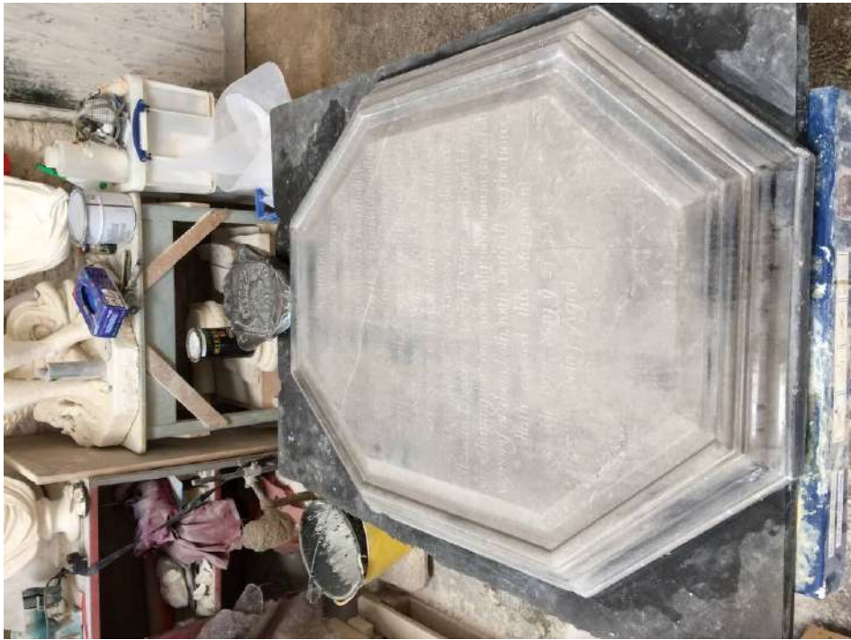
Plaque after restoring the polished surface.