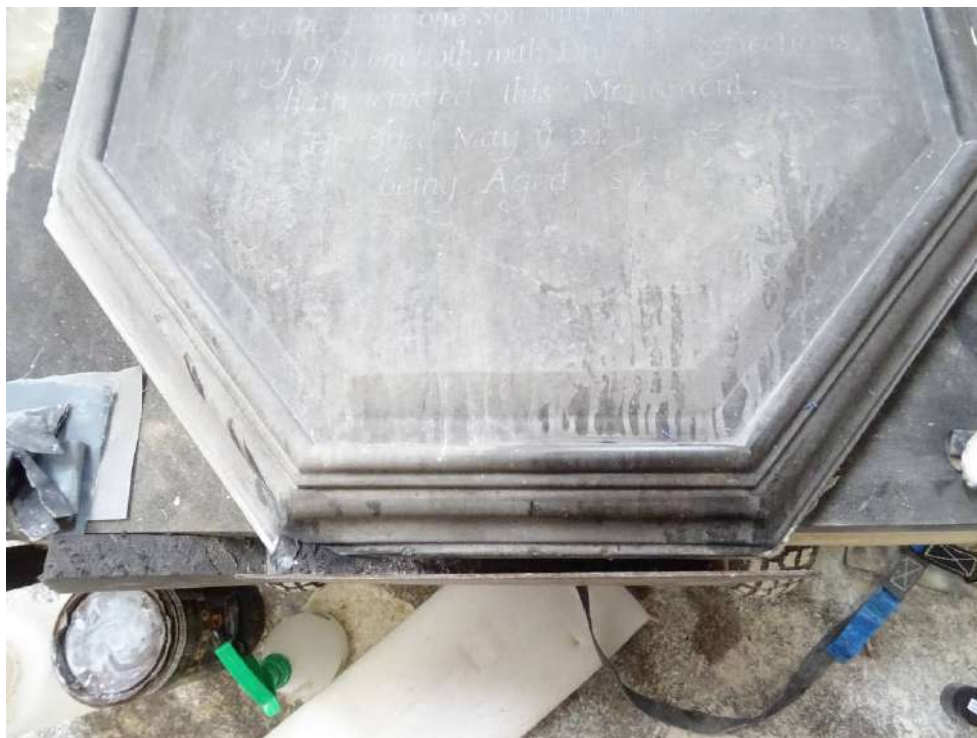
The water streaks have etched into the surface leaving lighter coloured stone.