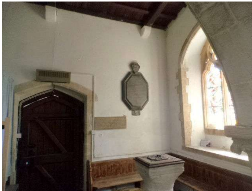
Following painting of the surround