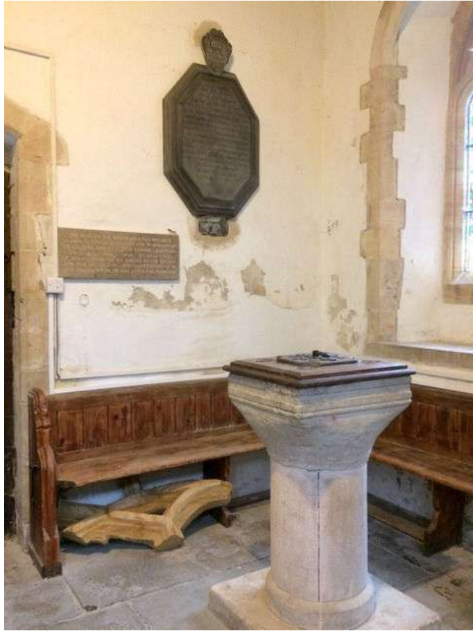
Plaque in its new location on the south wall.