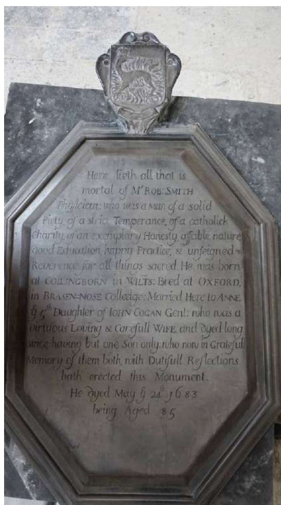
Plaque on completion of treatment.