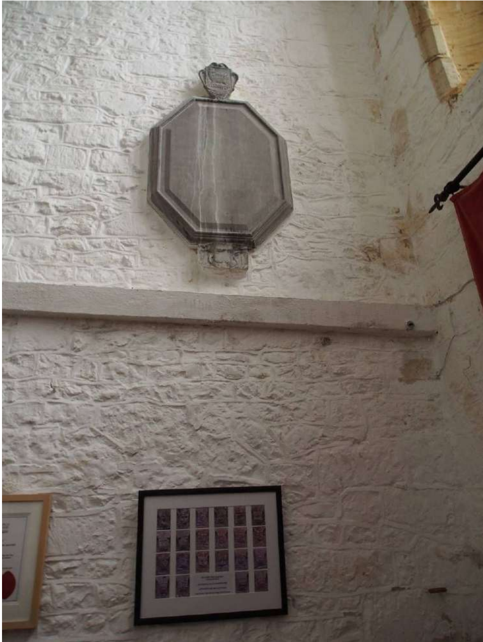
This image shows the plaque in its original location. Note the water streaks.