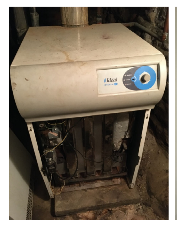
Photographs 2 & 3: Church Boilers

It is recommended that the existing Ideal Concord CXA gas boiler be replaced with a modern alternative. Additionally, the client may consider exploring the possibility of installing an air source heat pump heating system in order to move towards the goal of decarbonising energy consumption.