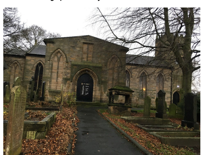
Photograph 1: St. Marys Church External View

A site survey was undertaken by Tim Mawby on Tuesday 10<sup>th</sup> December 2019. The survey was non-invasive (visual only) and entailed a general walk throughout the church areas, including back of house spaces and plant rooms.