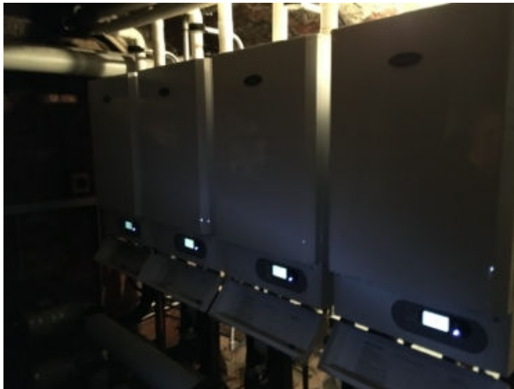
Photograph 2: Church Boilers

It is recommended that the client explores the possibility of installing an air to water heat pump heating system in order to move towards the goal of decarbonising energy consumption.