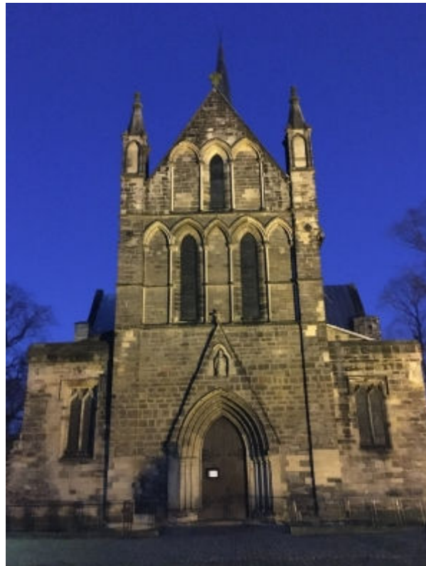
Photograph 1: St. Cuthbert's Church External View

A site survey was undertaken by Tim Mawby on Monday 9 th December 2019. The survey was non-invasive (visual only) and entailed a general walk throughout the church areas, including back of house spaces and plant rooms.