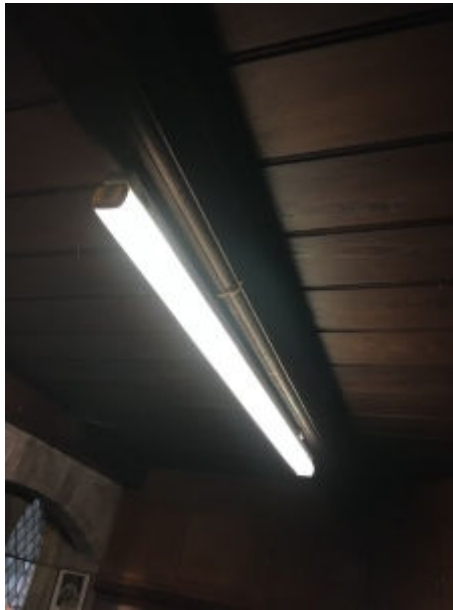
Photograph 5: Fluorescent Tubes