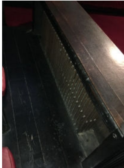
Photograph 3: Church Radiators

A range of portable plug-in heaters are also present throughout the building and are used to provide additional heating to the smaller rooms when required.