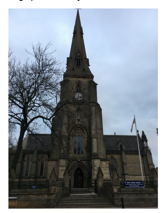
Photograph 1: St. Mary's Church External View

A site survey was undertaken by Tim Mawby on Wednesday 4<sup>th</sup> December 2019. The survey was non-invasive (visual only) and entailed a general walk throughout the church areas, including back of house spaces and plant rooms.