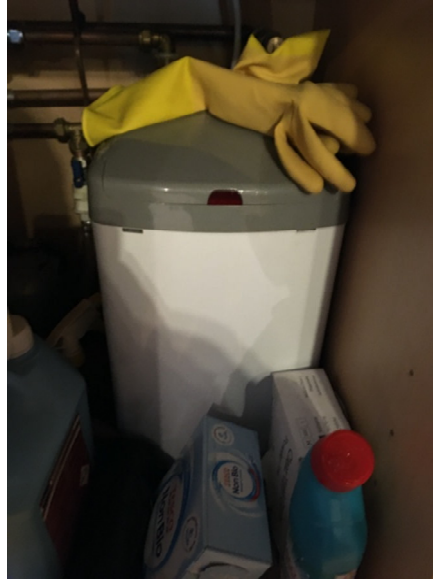
Photograph 4: Electric Water Heater

Hot water is provided to the building a 3kW Optima electric water heater, serving kitchen and WC areas. There is also a 10-litre Buffalo Autofill CF357 electric point of use water heater located in the kitchen. Hot water consumption is considered to be nominal.