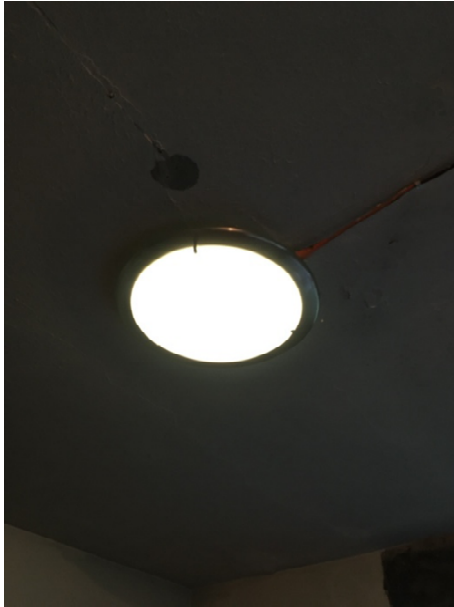
Photographs 7 & 8: Church Hall Light Fittings