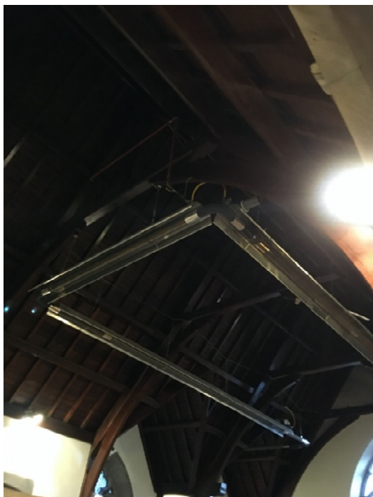
Photographs 2 & 3: Gas Radiant Heating System & Electric Wall Heater

The church also contains 2no. 3-bar (each 3x1.5kW) electric wall heaters. A range of portable plug-in heaters are also present throughout the building and are used to provide additional heating to the smaller rooms when required. This can be an ineffective, inefficient and poorly controlled means of providing space heating, and can easily be left on when unoccupied. It is recommended that a more permanent heating solution be provided to these spaces if and when heating upgrades are undertaken.