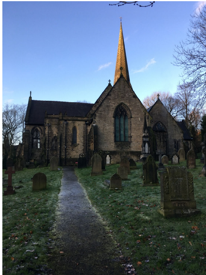
Photograph 1: Christ Church Friezland External View

A site survey was undertaken by Tim Mawby on Thursday 5 th December 2019. The survey was non-invasive (visual only) and entailed a general walk throughout the church areas, including back of house spaces and plant rooms.