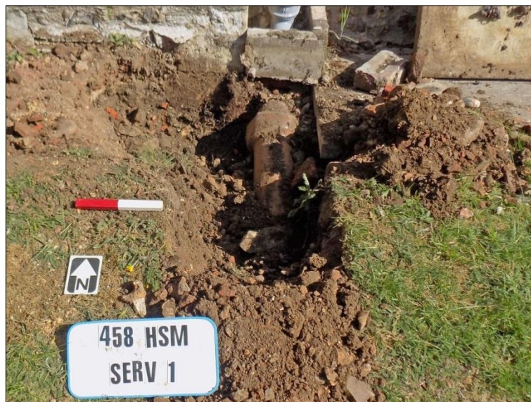
Plate 1: Pit 1, view north