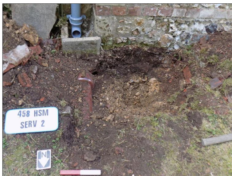
Plate 2: Pit 2, view south