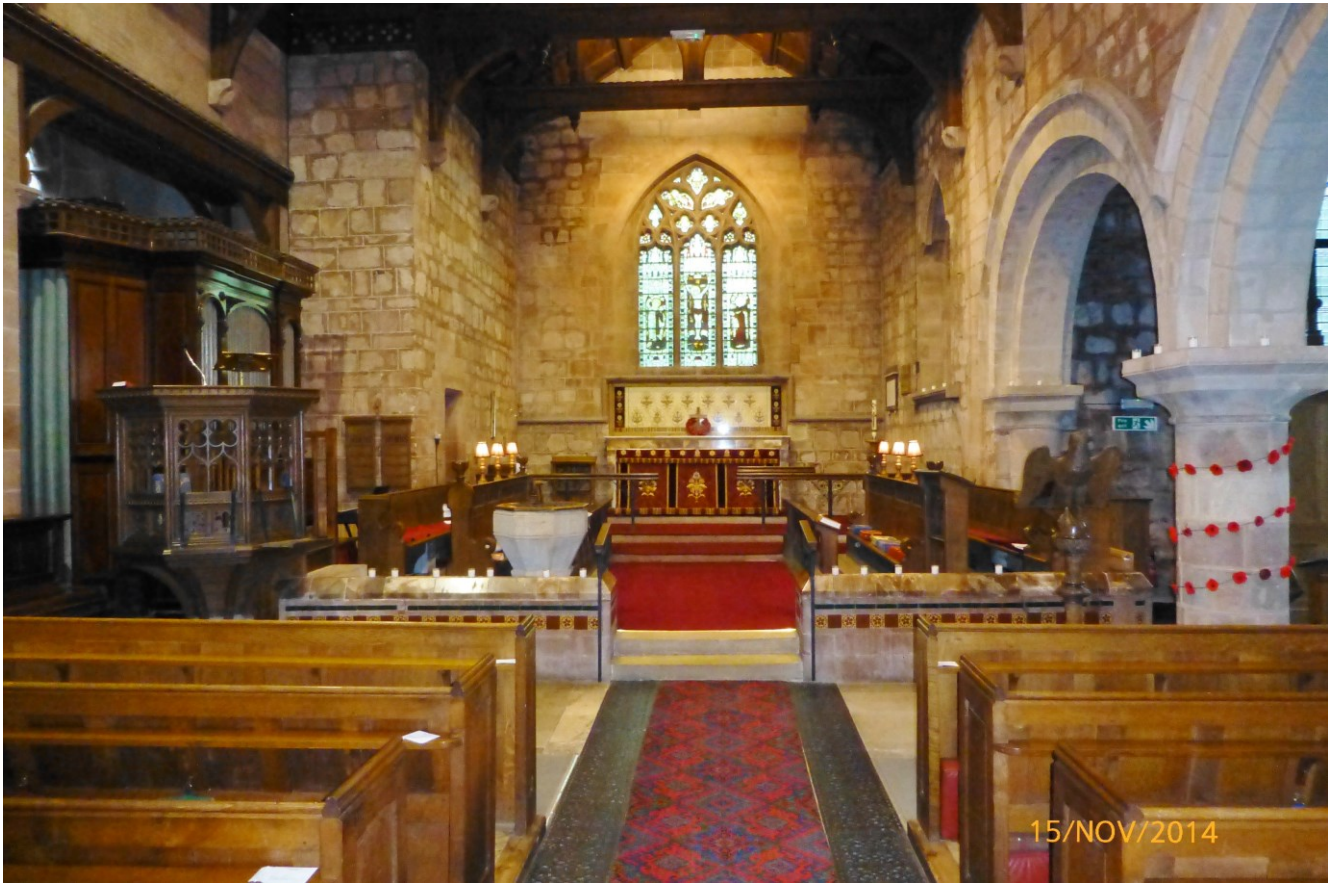
Photo of the chancel showing the low front wall