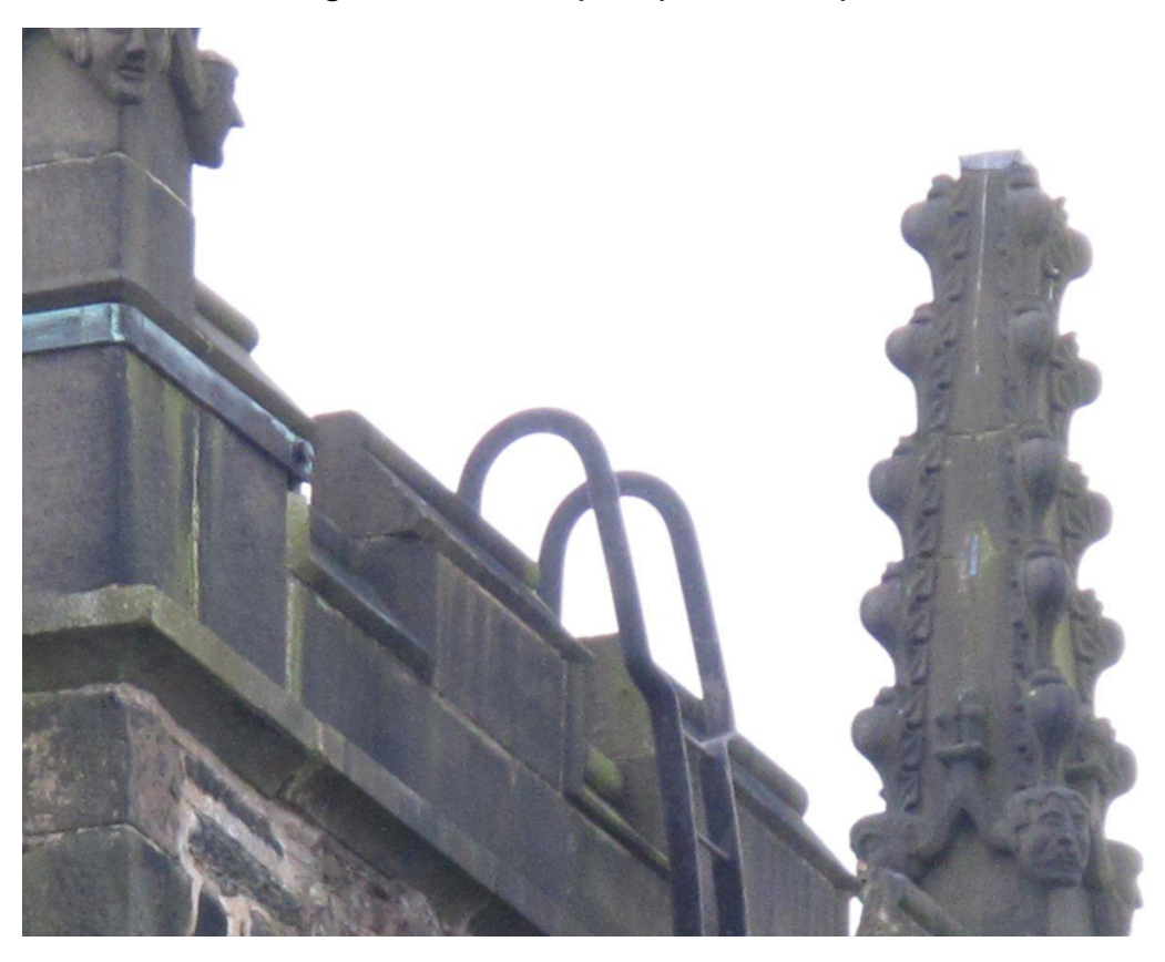
NE Pinnacle showing lead cap