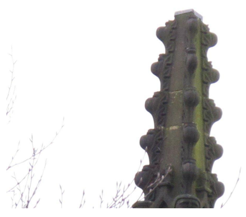
Pinnacle showing new lead cap to protect exposed dowel and masonry