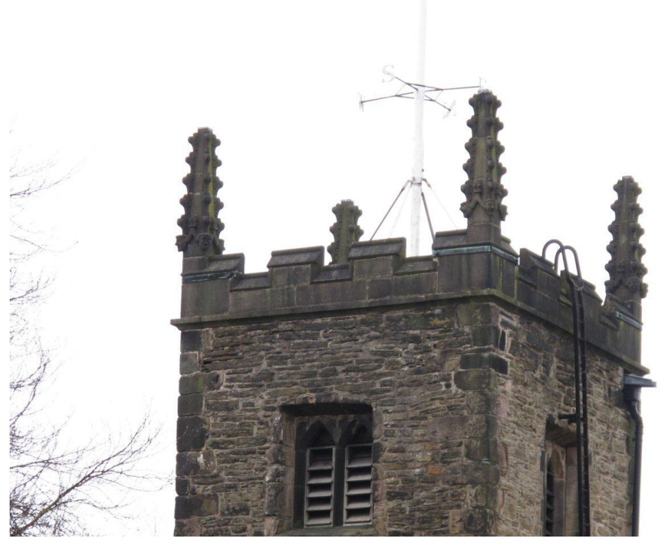
Close up of Tower with all four finials in view