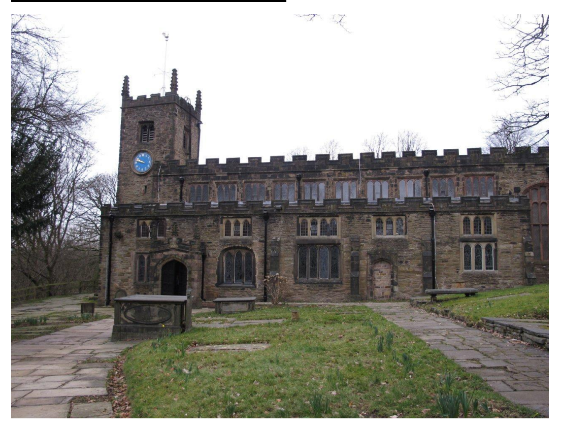
External south elevation showing the pinnacles without their caps